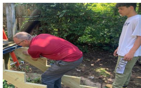
Porch repair on Main Street

Our crews have been called and exemplified their leadership efforts to help further transform the New Kensington Community by empowering established residents for opportunities in home repair and restorations. Through our Brush with Kindness program and with the direct support of Westmoreland Community Action, we have been able to execute service to some of our most at need neighbors by providing home repairs including porch repair, gutter and downspout repair, and replacement, foundational repair, window replacement, just to name a few.