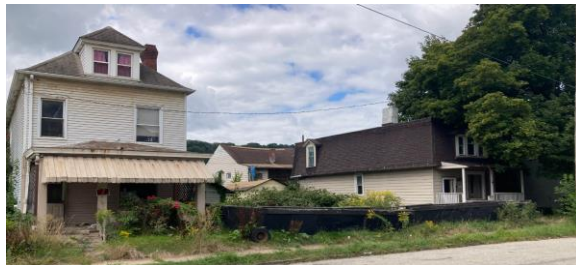
Pictured 544 & 547 4 th Avenue, New Kensington