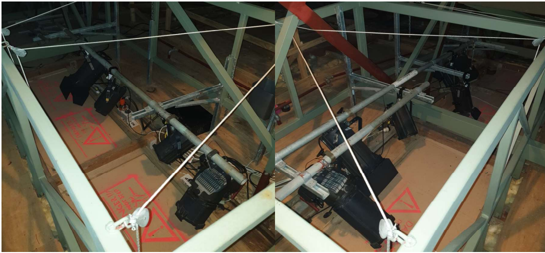
Ceiling Mounted Front lights