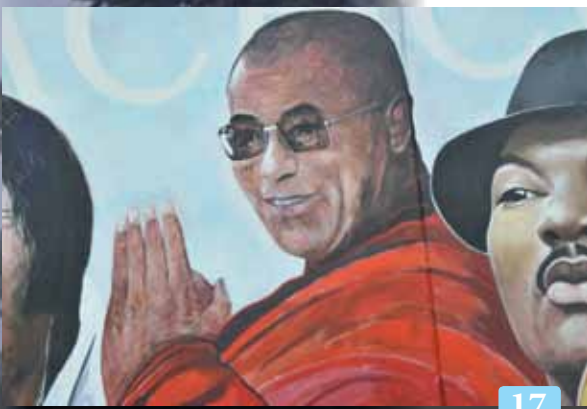
THE DALAI LAMA

"An individual has not started living until he can rise above the narrow confines of his individualistic concerns, to the broader concerns of all humanity."