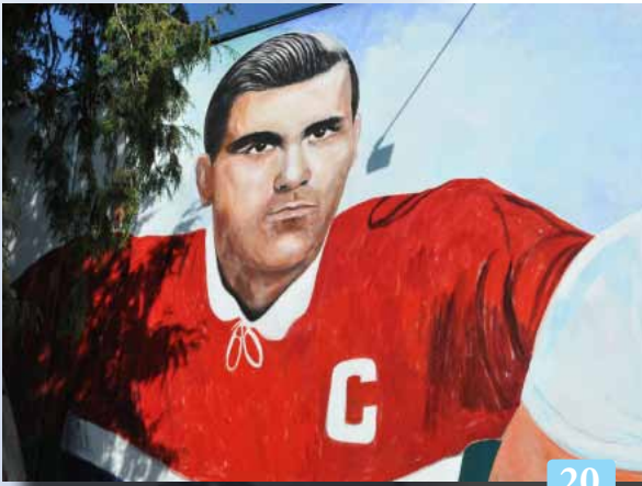
MAURICE 'ROCKET' RICHARD

WEST FACING WALL 132nd STREET and COMBER WAY, SURREY BRITISH COLUMBIA, CANADA