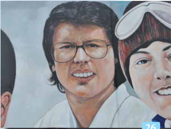
BILLIE JEAN KING

WEST FACING WALL 132nd STREET and COMBER WAY, SURREY BRITISH COLUMBIA, CANADA