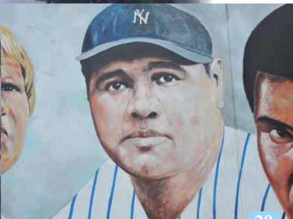
GEORGE 'BABE' RUTH

"Float like a butterfly, sting like a bee."