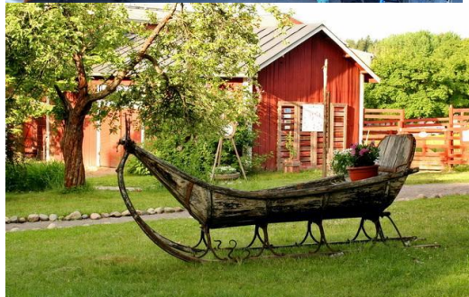
4H FARMYARD YLI-MAROLA

Send your CV and motivation letter until 31.1.2018 annina.kurki@lahti.fi