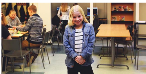
LAUNE YOUTH CLUB

IN THE SUMMER VOLUNTEERS WILL BE WORKING WITH ORGANISATION 4H IN THEIR FARMYARD. TASKS ARE HELPING WITH FARMYARDS EVERYDAY LIFE, INCLUDEDIN TAKEING CARE OF ANIMALS AND WORKING WITH VISITORS, CHILDREDN AND YOUTH!