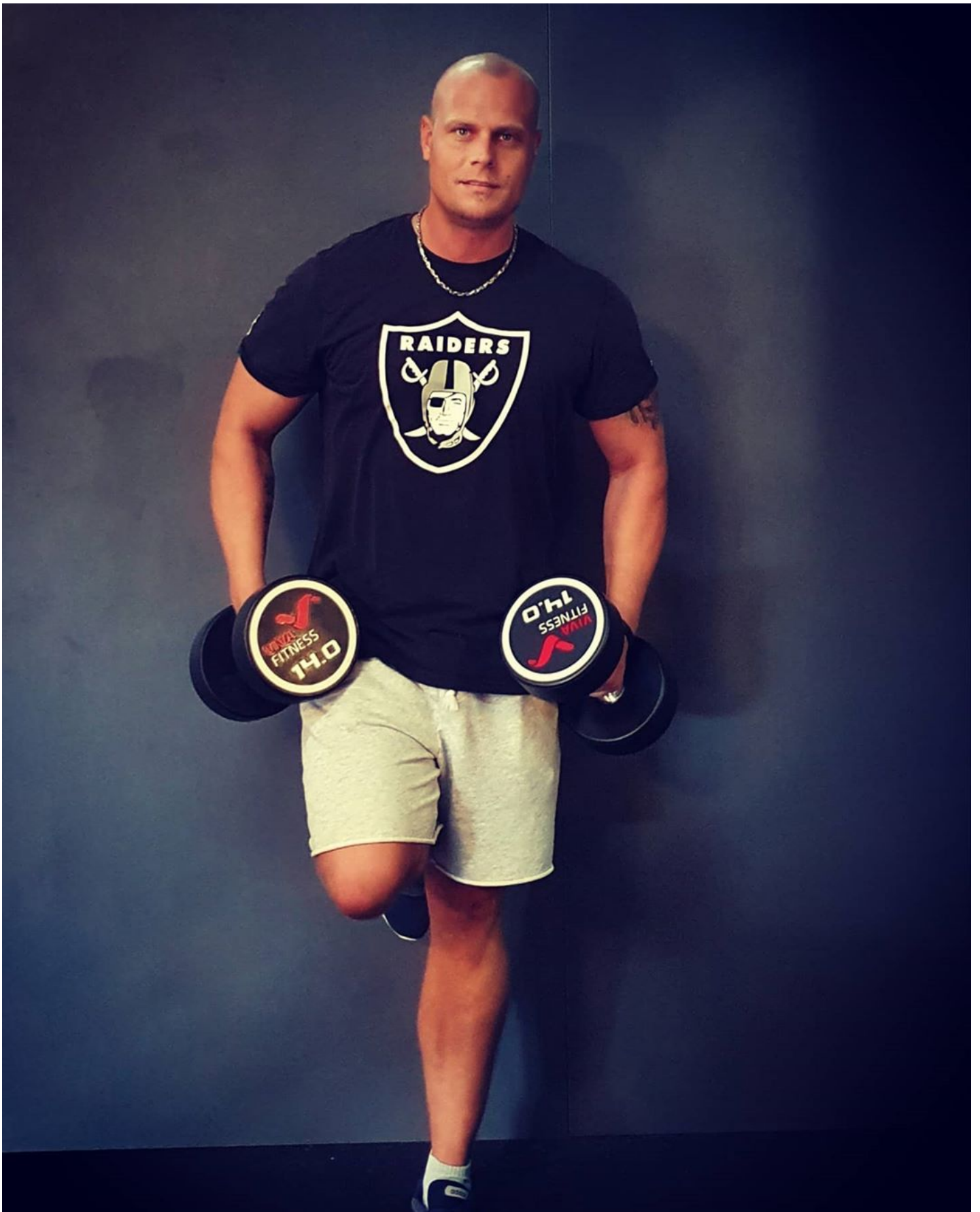
Starting the week off like it's Friday #flexing #sunday #sunsout #gunsout #gunsofinstagram #gunshow #gymrat #gymtime #mytime #mytimeisnow #doshit #cheatday #gymday #anyday #everyday #nevergiveup #neverquit #fitfam #instafit #fitover40 #oldmanstrength #keephammering #nobodycaresworkharder #nodadbod