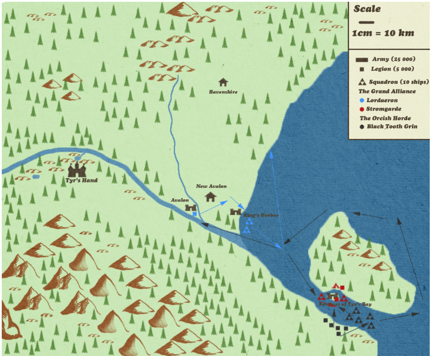
Map depicting the Battle of Tyr's Bay.

Who was the master mind behind the Horde operational plan, we may never know. There are conflicting sources, some saying it was Maim Blackhand himself, some suggesting it was Warosh, with Maim playing only a supporting role in its conception. What is important though, is that it worked almost seamlessly. Stromic forces completely failed to successfully monitor the activities of the Horde, as trolls of the Horde knew this land very well and managed to capture and murder any Alliance scout. With his eyes blind, Armen was unable to foresee the Horde intentions, and ran directly into their trap.