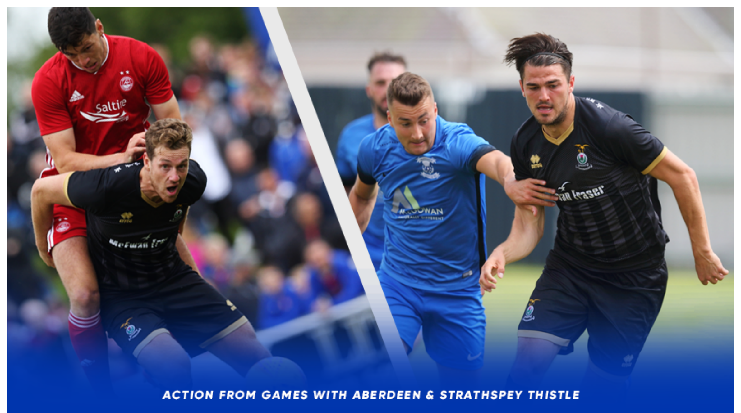
ACTION FROM GAMES WITH ABERDEEN & STRATHSPEY THISTLE