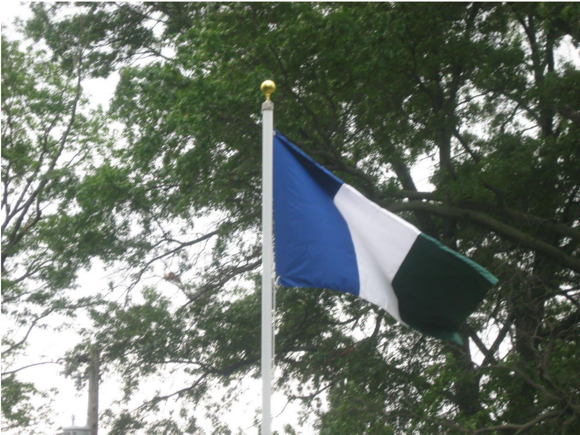
First a Bastion, Then a Nation: Selected Quotes of David Lane on the Northwest Territorial Imperative