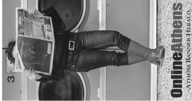
OnlineAthens ATHENS BANNER-HERALD