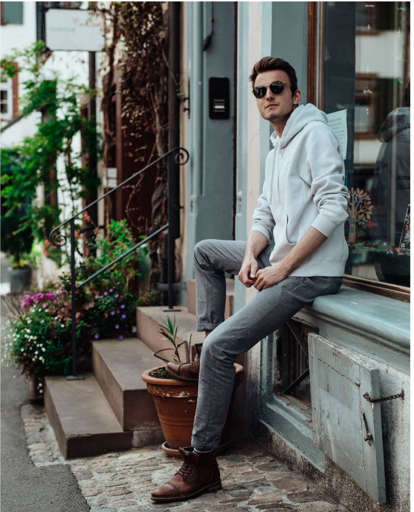
#rainy #loungeset #loungewear #fitness #inspiration #motivation #fitdutchies #fitnessmotivation #fitspo #gym #workout #cosy #crossfit #crossfitgirls #gymmotivation 1349