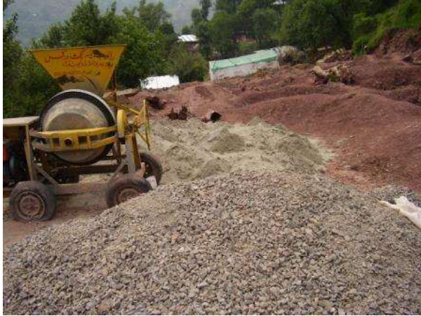
School main building under construction

During the execution of the works, the soil testing and site stability report were also checked by and established in cooperation with M/S GEOENGINEERS.