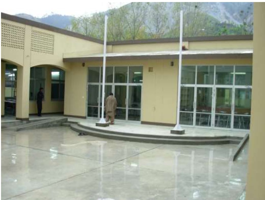
Court Yard of the Girls School

To encourage rehabilitation by providing an earthquake resistant permanent school building for continuation of education for the children of Kashmir.