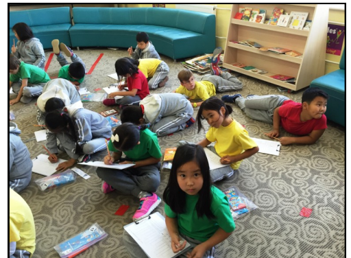
From the Library: (left and above) Students from 3A practice putting Fiction books in order by the Author's Last Name before having time to checkout books and read silently during their Library Specials time.