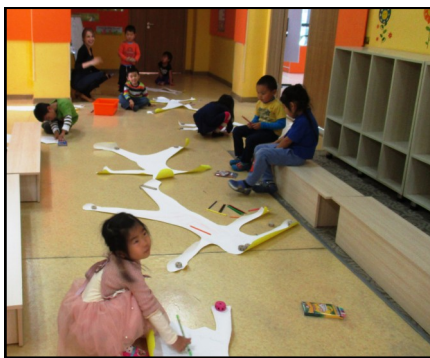
From Pre-Kindergarten: (left) Students work on "My Body" drawings for their recent Letter B week.