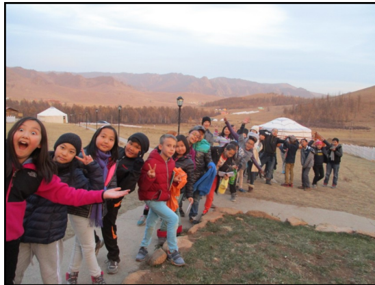
Fifth graders enjoying the nature, sunshine, and fresh air of Terej National Park.

ASU fifth graders and teachers enjoyed an overnight ger camp trip just before Fall Break on October 15 th -16 th .