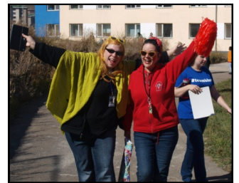
Faculty House Spirit

students worked hard and cooperated with their team members. It was