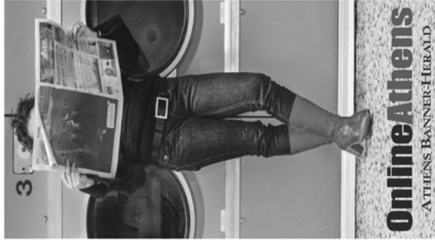
OnlineAthens ATHENS BANNER-HERALD