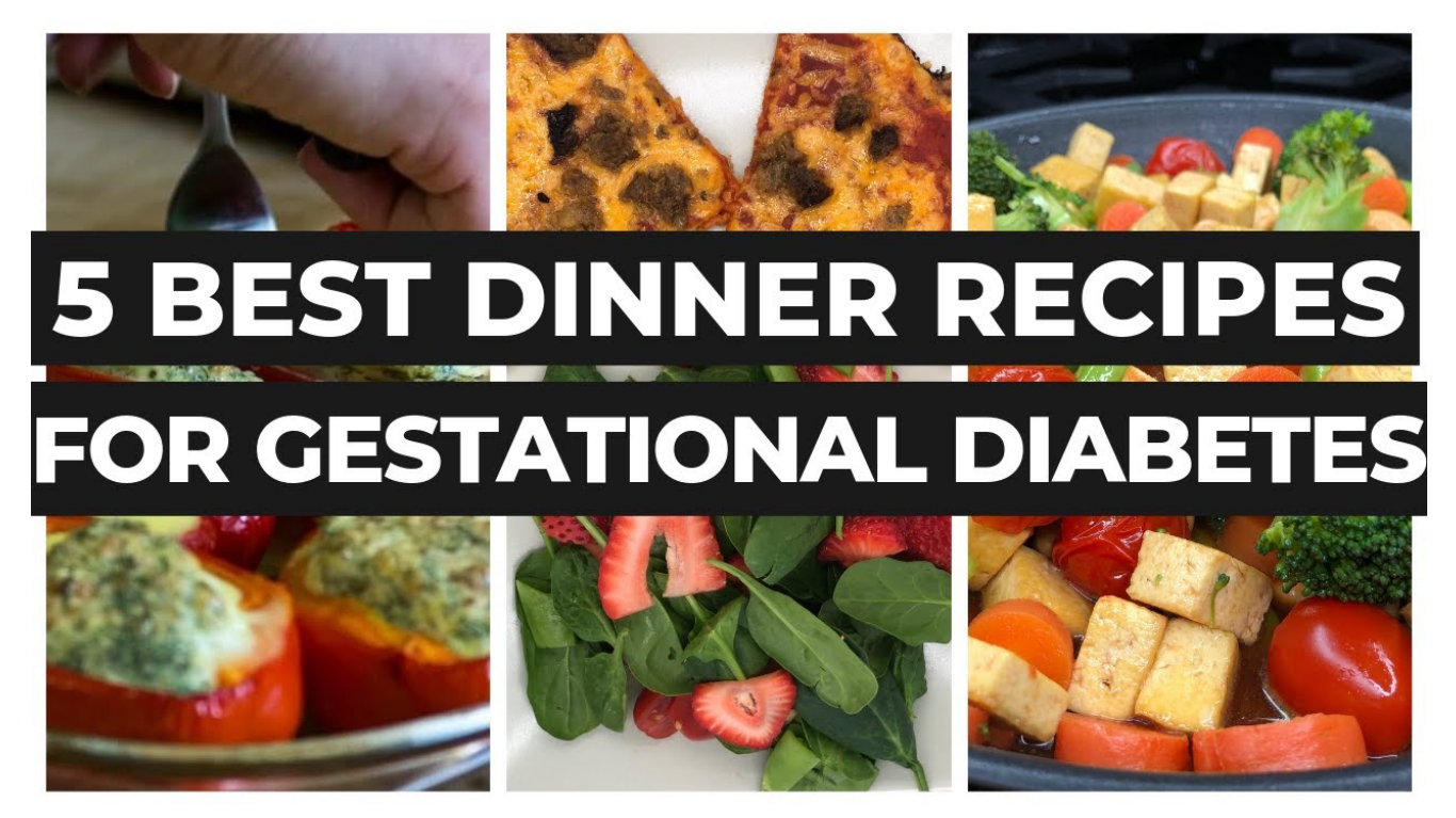
Indicators on 11 Best Healthy Recipes - Easy Healthy Recipes - NDTV Food You Need To Know

View: What does a Clean-Eating Day Appear Like?.