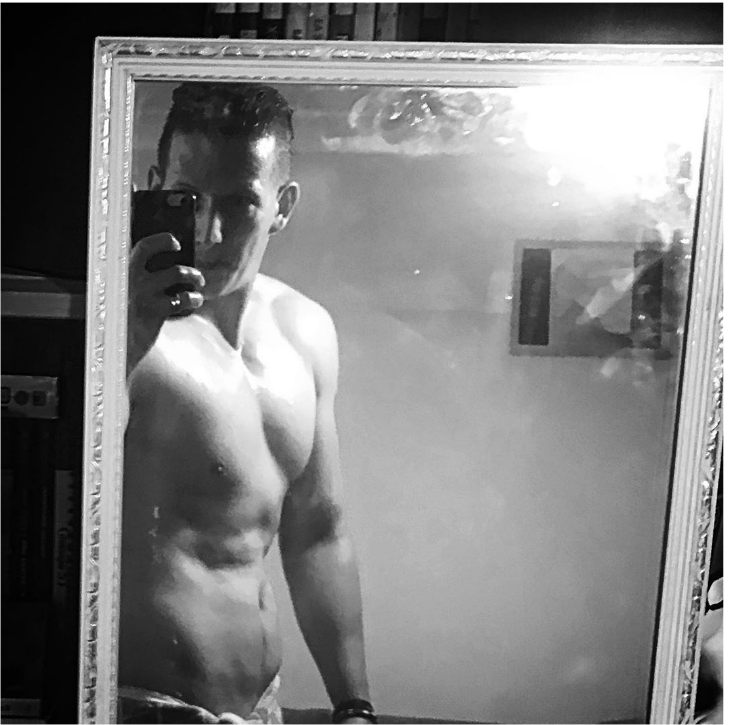
#fit #fitness #bodypositive #gymfitness #bodybuilding #fitness #shredded #gym #gymlife #bodybuilder #muscle #success #workout #strong #hardwork #gymmotivation #fitnessmotivation #focus Ptics #fit