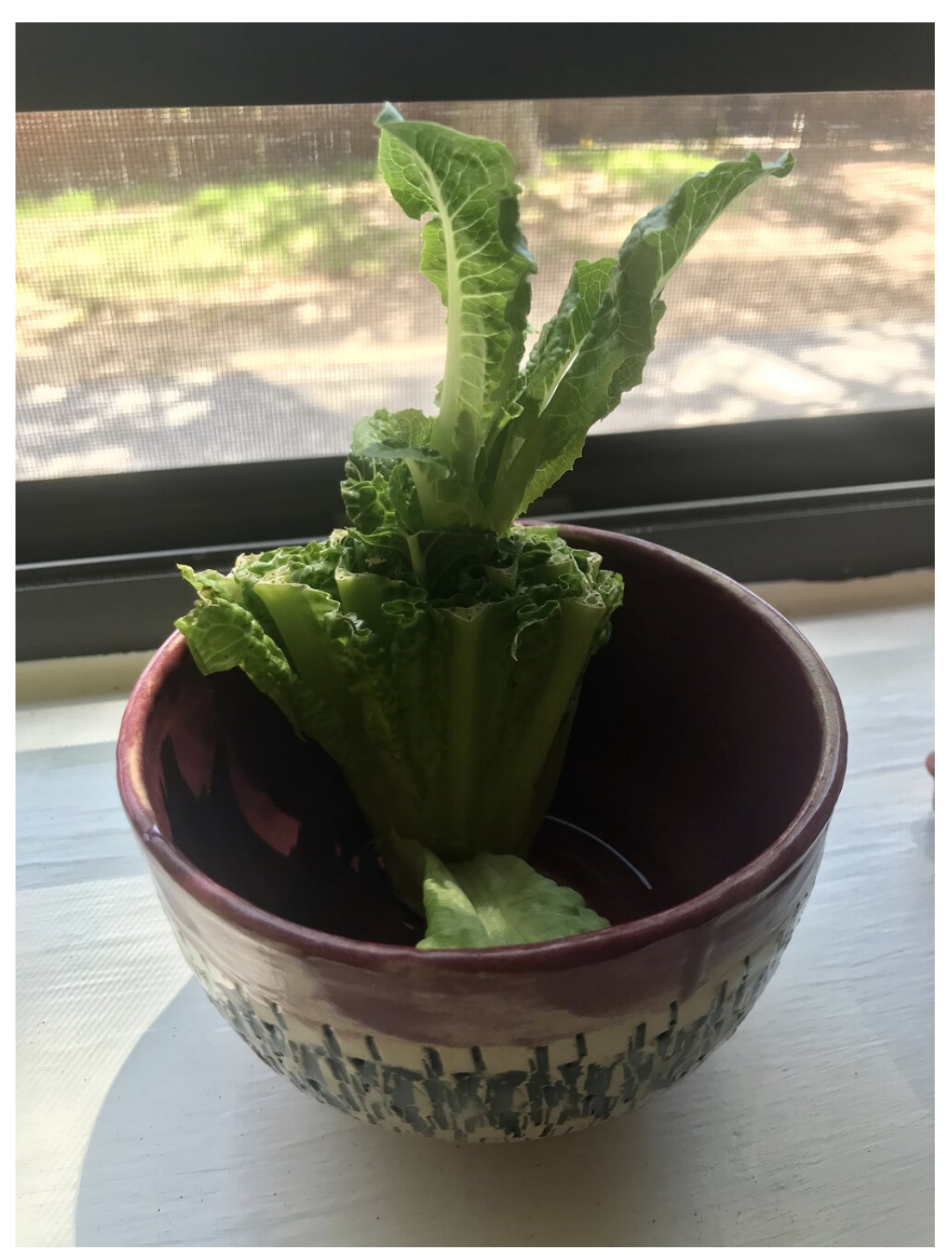
Can Be Fun For Everyone

For decades, the key ways for detection of microbial virus in foods and professional examples took days to do and also depend on culture-based assays and biochemical tests for confirmation. Discovery of viruses as well as parasites, on the various other hand, was also more tiresome in that seclusion of the pathogen from the sample was called for prior to its detection.