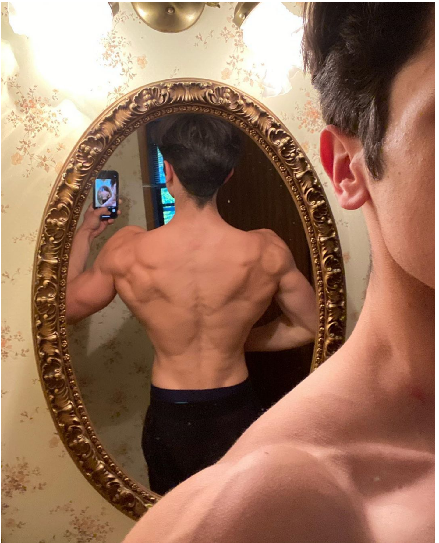
#sunwukong #monkeyking #joker #jouneytothewest #monkey #king #superpower #super #power #hero #muscle #delicious #need #man #men #handsome #handsomeboy #sixpacks #chest #smart #guy