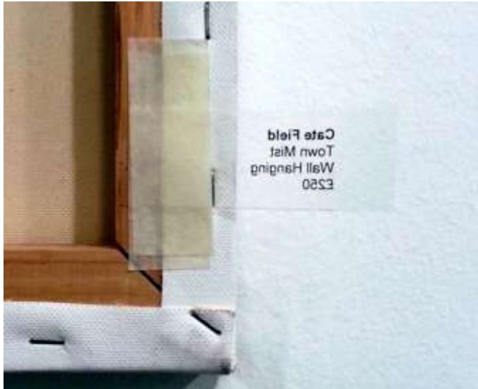
Clear acetate label attached to the back of the work using masking tape

Please do not attach anything onto the walls – no tapes, no glue, no blue tack, etc.