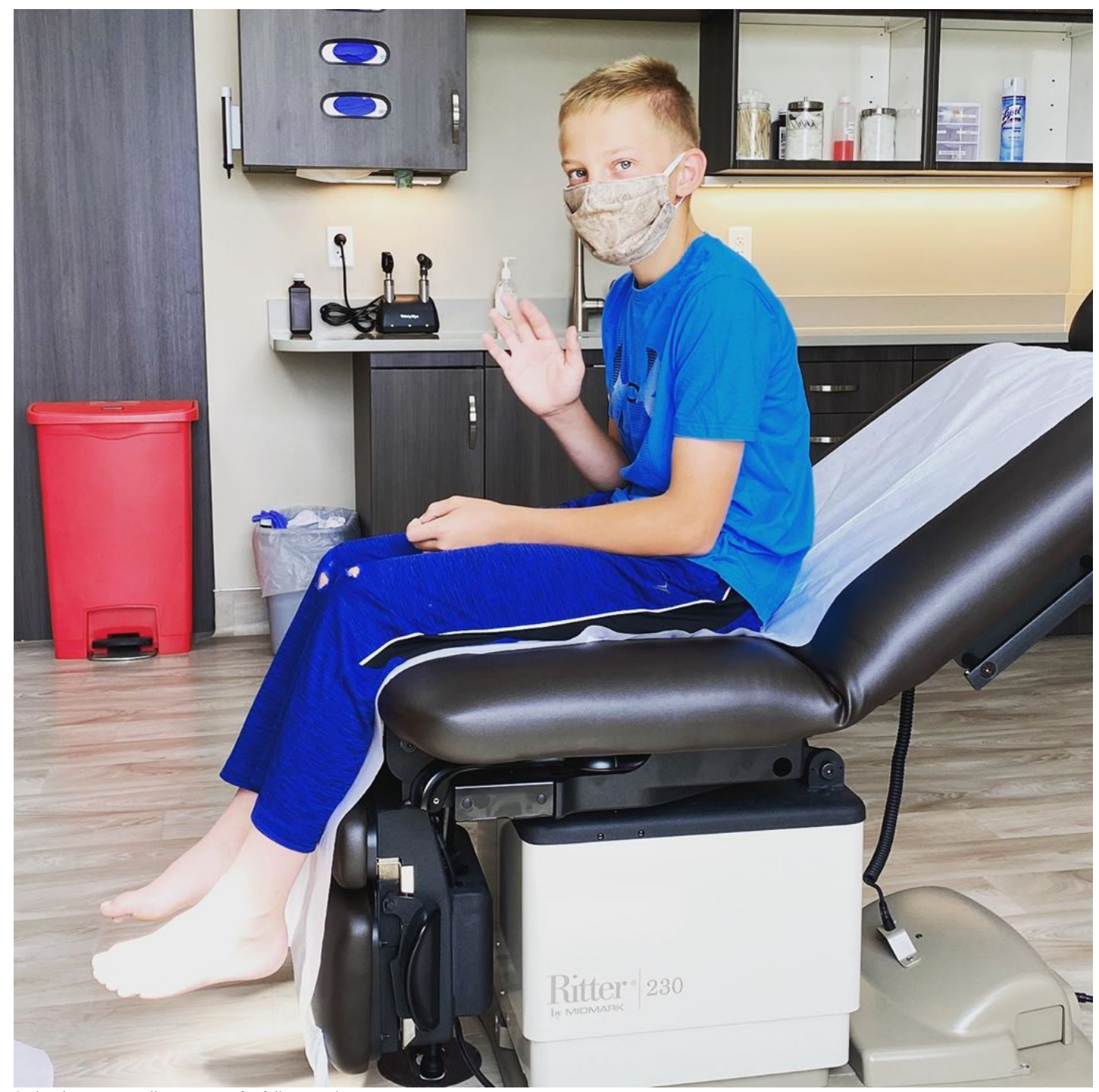
Seriously. Its not at all uncommon for folks to pack on