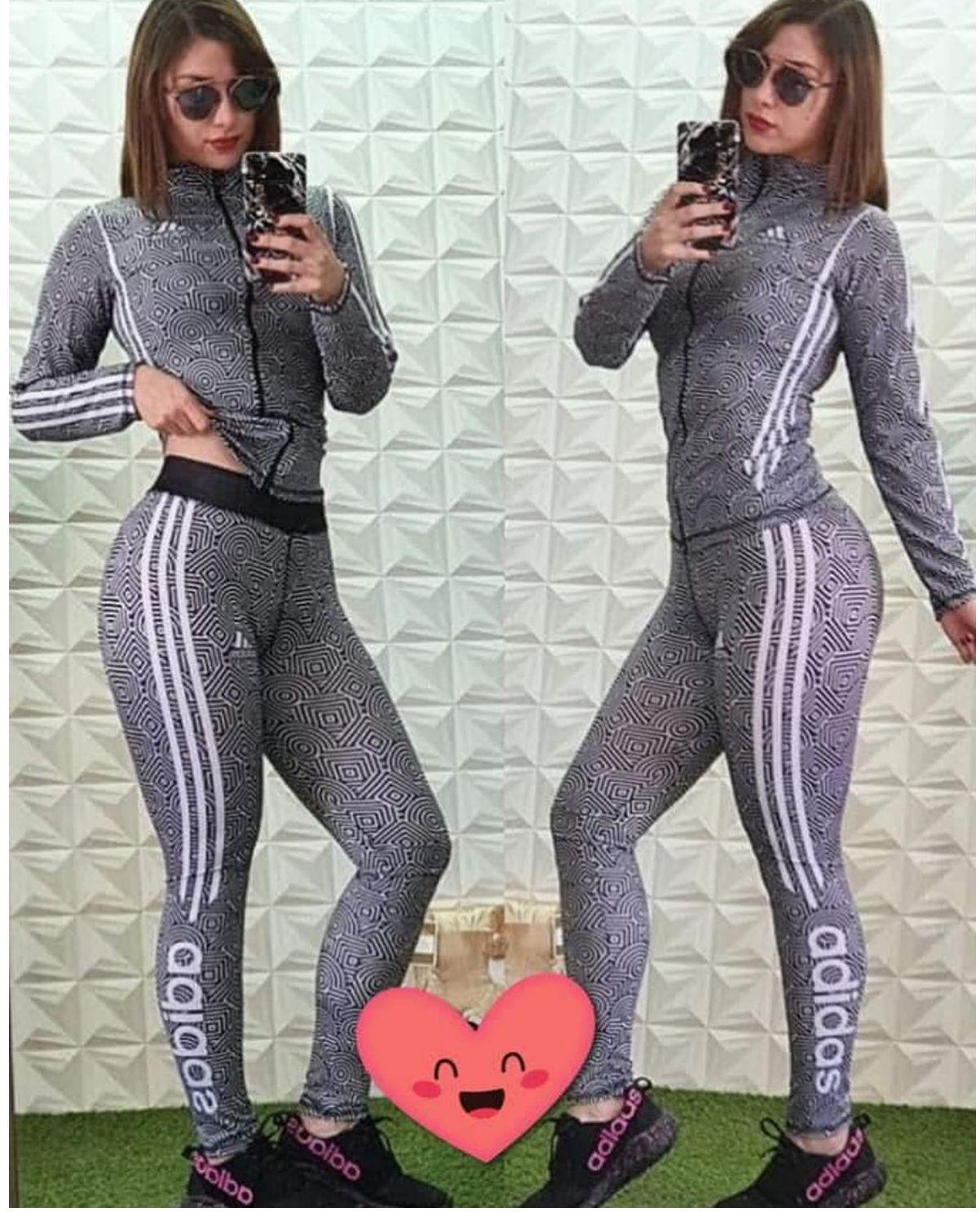
#health #fitness #wellness #healthy #healthylifestyle #motivation #workout #gym #love #fit #lifestyle #nutrition #training #covid #fitnessmotivation #weightloss #exercise #healthyfood #quotes #bodybuilding #beauty #life #healthyliving #instagood #food #diet #healthcare #coronavirus #selfcare #bhfyp Yes Clydebone is the best prohormone of its kind on the current market.

\underline{http://anadrol-legit-webiste-to-buy.over-blog.com/2020/06/oxymetholone-50-mg-kopen-in-belgie-by-singani-pharma-50-tabs-1.06.html}