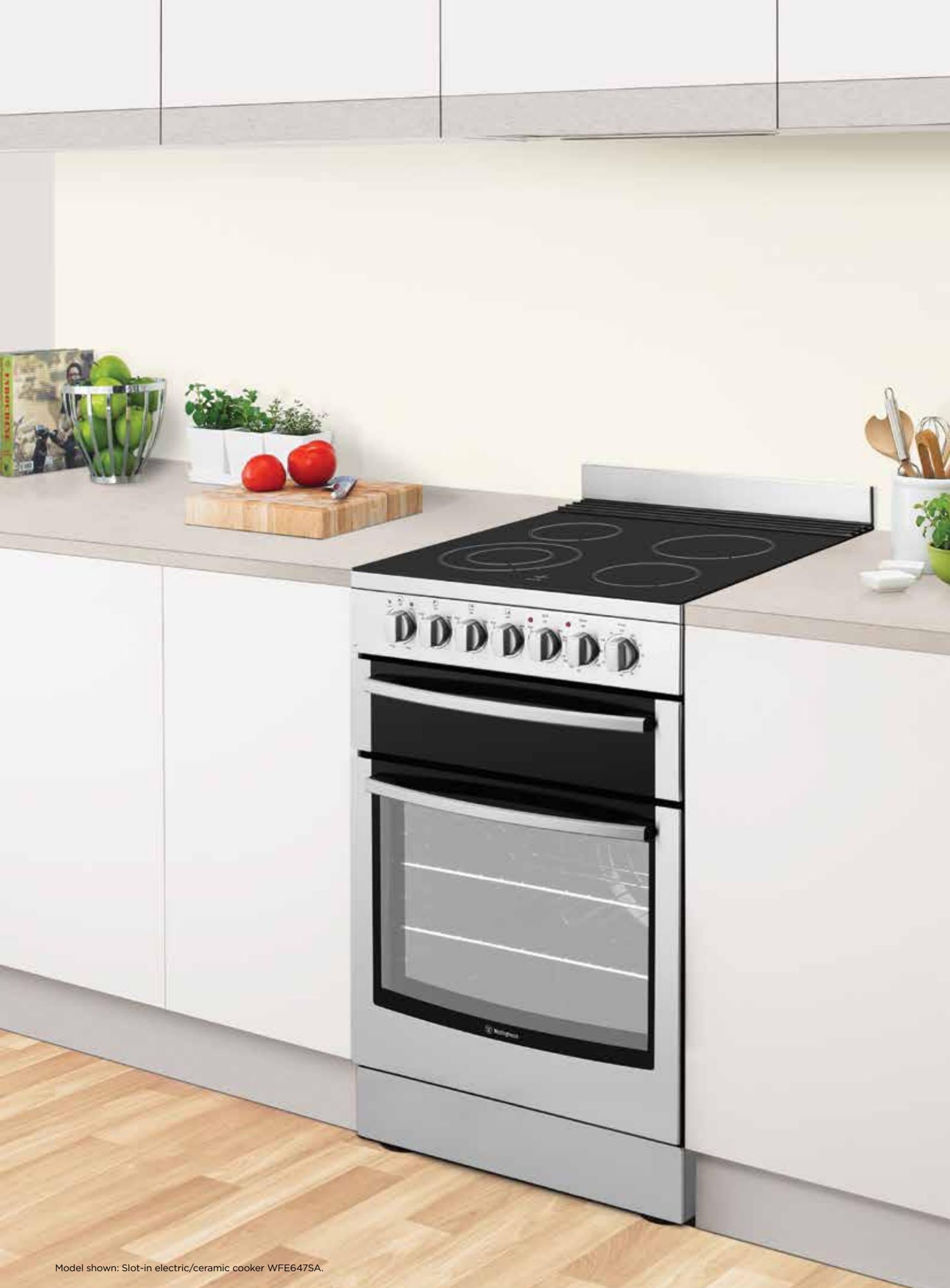
Model shown: Slot-in electric/ceramic cooker WFE647SA.