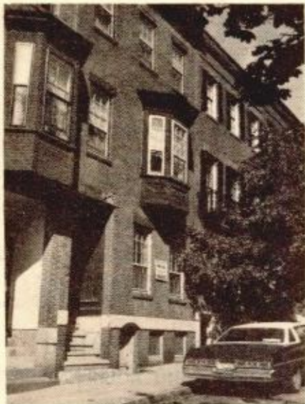
Nice three unit on the best street in town - working fireplaces, wood floors, nice details, yard and deck. Offered at $179,000