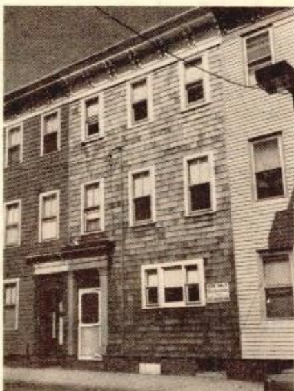
Owner says sell! A little T.L.C. will make this wood frame a lovely home - will not last at $65,000