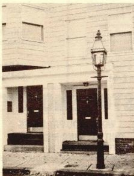
Excellent value in these one-two bedroom Condos in Town Hill area. $47,000 - $70,000