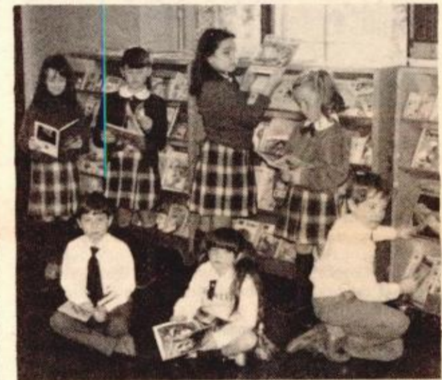
STUDENTS of the St. Francis de Sales School browse through books to purchase for their own enjoyment at the Second Annual Book Fair. Proceeds from the Fair were used toward the school's library fund.