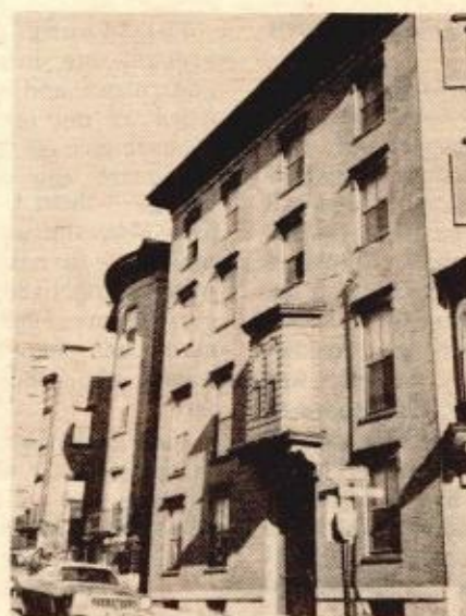
Location, location, location... magnificent four story Victorian between the Monument and the Training Field, with fabulous details, mouldings, older fireplaces - a restorer's dream $175,000