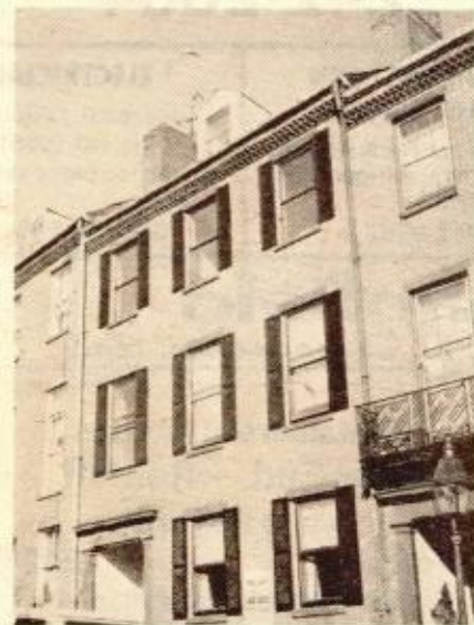
Three unit brick Greek Revival in Harvard Mall location. Handsome renovation. Excellent rents. $210,000