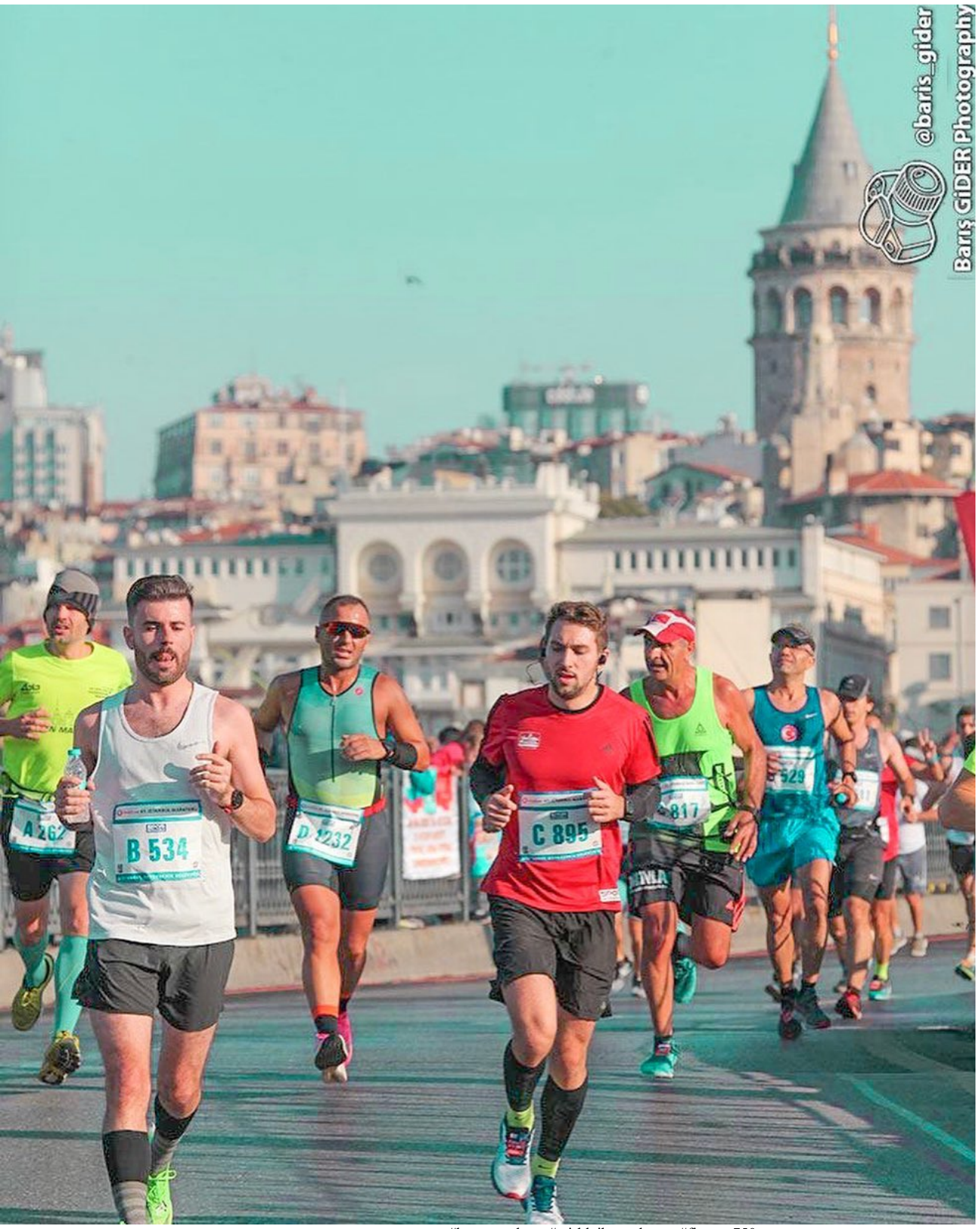
#homeworkout #wirbleibenzuhause #fitness 750