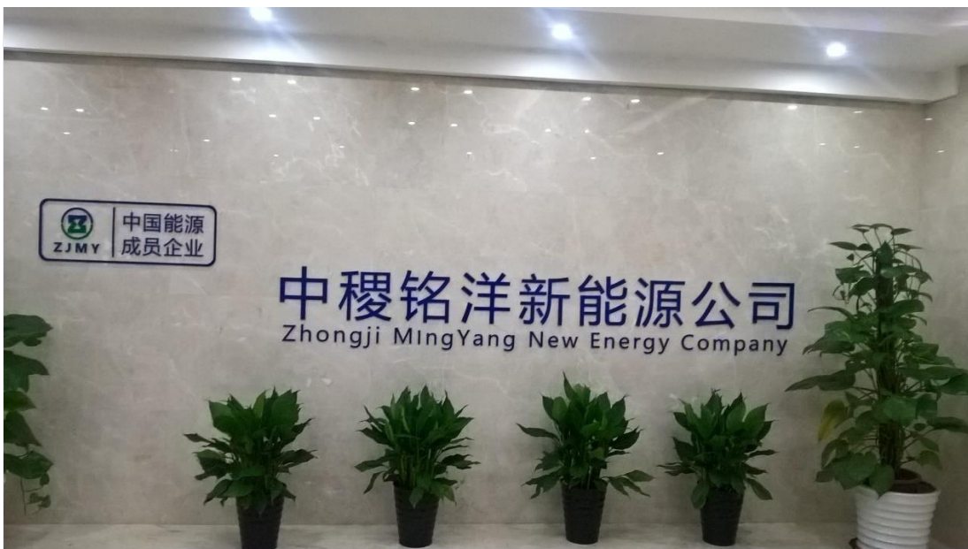
ZJMY on the fifth floor of the cultural industry park building