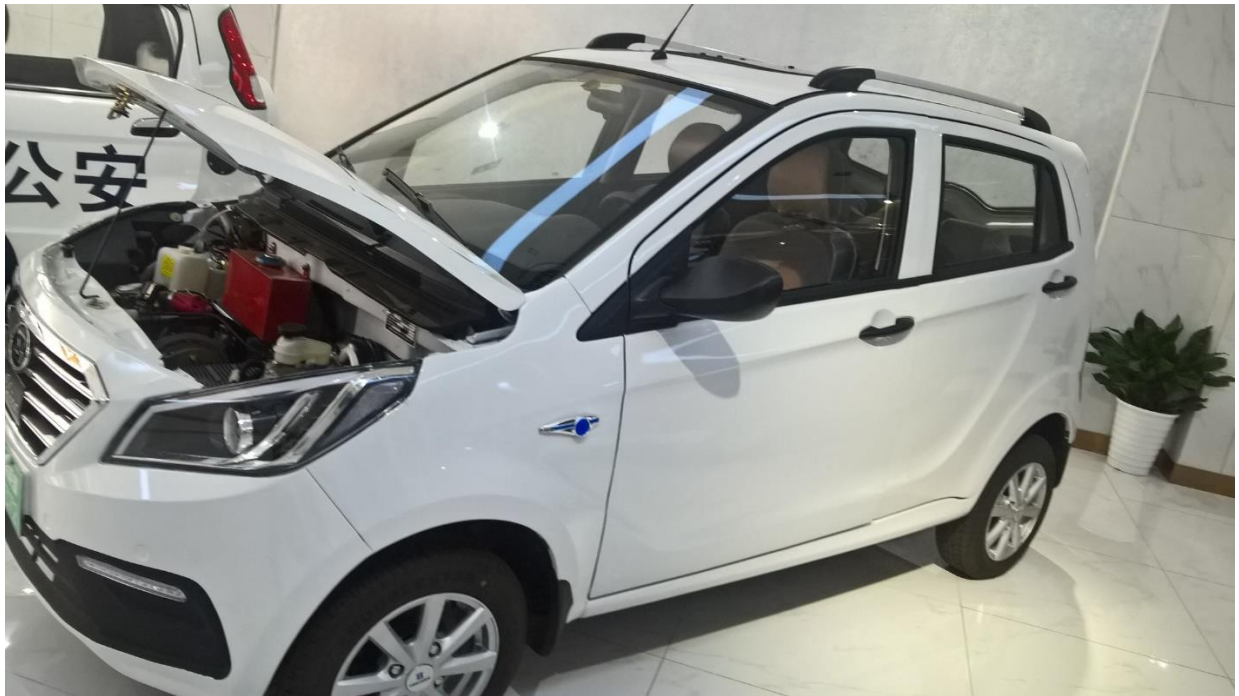
Low speed car open hood