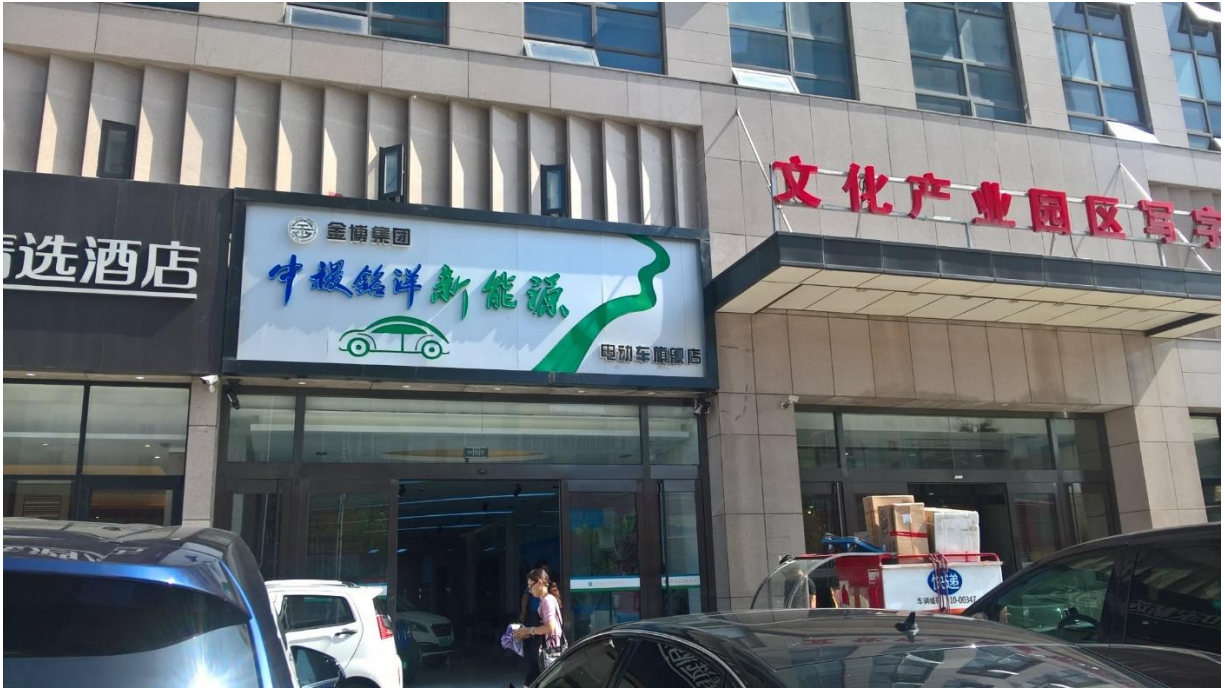
Store front of ZJMY EV showroom