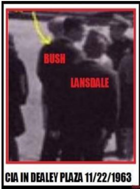
CIA IN DEALEY PLAZA 11/22/1963