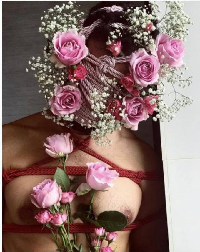
Figure 7. Fabio da Motta bondage series (from @damottafabio instagram profile)