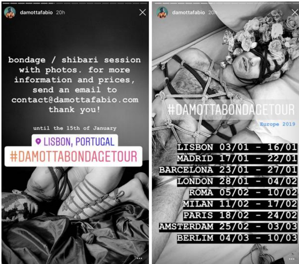
Figure 5. Fabio da Motta advertisement on his Instagram account @damottafabio