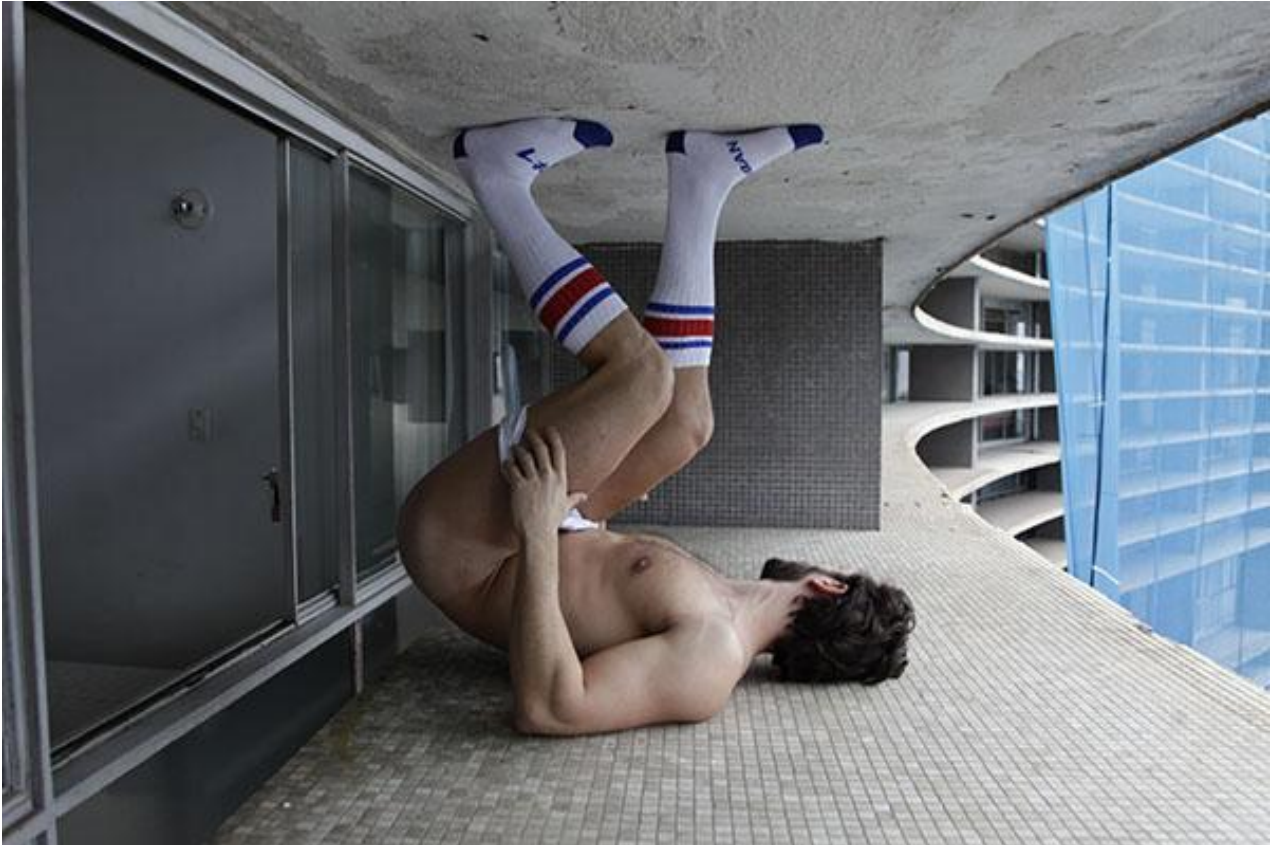
Figure 1. (da Motta, 2013) Curvas Concretas / Concrete Curves : a pre bondage series

beauty . . . My inspiration comes from my daily life, the environment I live in, the things I see. My use of color, flowers and other materials is a way to soften the bondage, emphasizing its beauty instead of the more aggressive aspects of immobilizing another human being. (Jansson, 2017, underline not in the original)