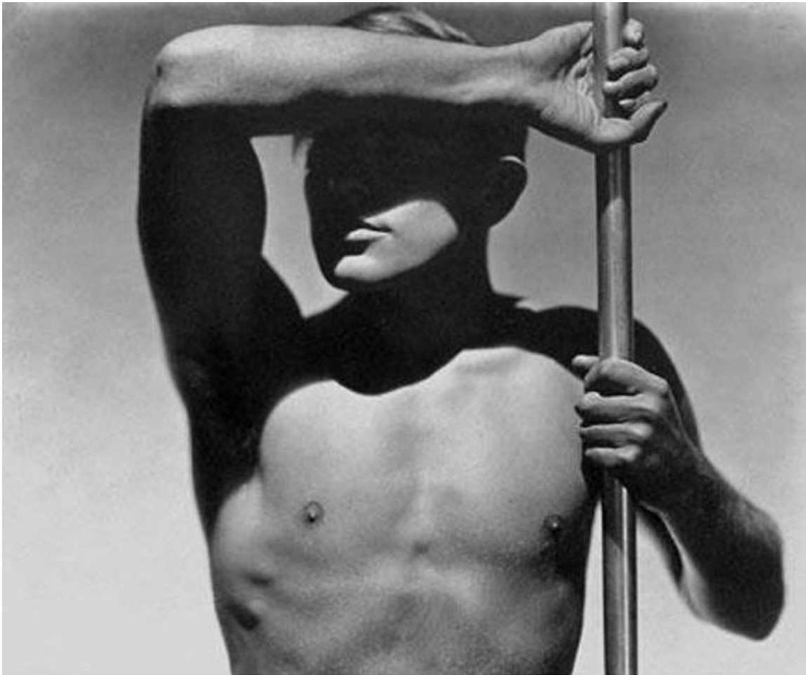
Figure 11 (Artnet.com, 2019) - George Hoyningen-Huene photography

Nowadays, da Motta faces a different kind of surveillance: the reporting of content that allegedly violates the Instagram Community Guidelines (Help.instagram.com, 2019). Although his option for a private profile (where the follower needs to request access to see his pictures) gives him more freedom to push the boundaries of his photos, his BDSM content is constantly on the edge of what would be acceptable by his heterogeneous audience. On the other hand, balancing explicitness in order to attend the visual limitations rules of this app, opens space to increase the curiosity of what is not shown (Figure 12). Like any other pornographic picture that was censored, hiding sexual intercourse or genitals do not deny the erotic but calls "attention to what was missing, giving the erotic dreamer a different space in which to maneuver than that provided in pornography"(Budd, 1998:55). The softness on his approach does not eliminate a non-conformist attitude. Moreover, he adds glamour as possible layer of bondage practice and desire to make the (gay) imagination flows.