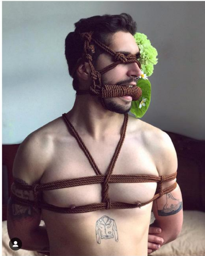
Figure 2. Fabio da Motta bondage series