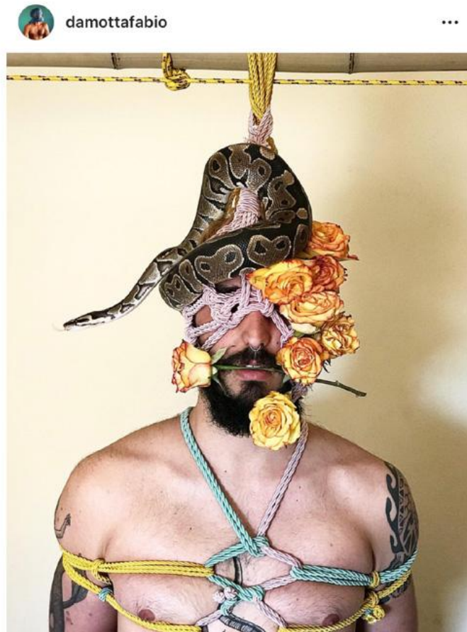
Figure 6. Fabio da Motta bondage series