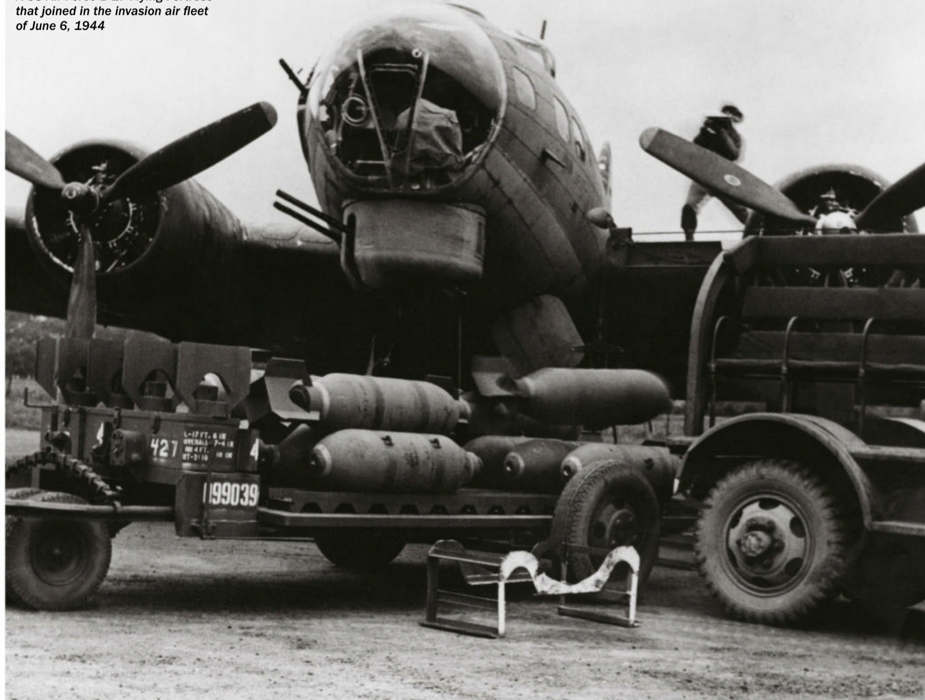
A US Air Force B-17 Flying Fortress that joined in the invasion air fleet of June 6, 1944

This was because although the Allies had significantly greater materiel superiority over the Germans, they only had the shipping to bring over a fraction of those men, guns and tanks and all that was needed for fighting a sustained battle in one go. Yet the moment they landed, the race would be on to see which side could bring to bear the most – and decisive number – of forces into the bridgehead. Air power was to make up for the shortfall in shipping by slowing German reinforcements reaching the front. Since the Reichbahn kept Germany fighting and was the prime means of moving men and materiel any distances, the more railway marshalling yards, locomotives, rolling stock and bridges that could be destroyed before the invasion, the