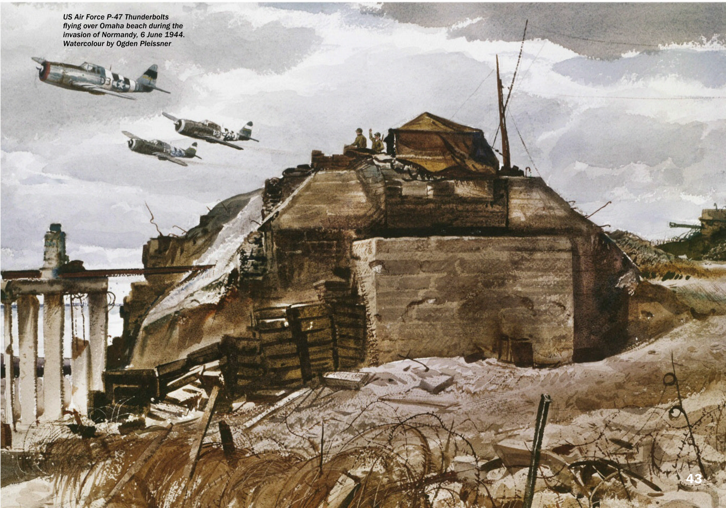
US Air Force P-47 Thunderbolts flying over Omaha beach during the invasion of Normandy, 6 June 1944. Watercolour by Ogden Pleissner

“Considering that they are all our friends,” Churchill wrote to Eisenhower on 3 April, “this might be held to be an act of very great severity, bringing much hatred on the Allied Air Forces.” After discussions with Tedder, Eisenhower replied two days later, pointing out that one of the prime factors in the decision to launch the invasion was the use of overwhelming air power. “I and my military advisors have become convinced that the bombing of these centers will increase our chances for success in the critical battle,” he