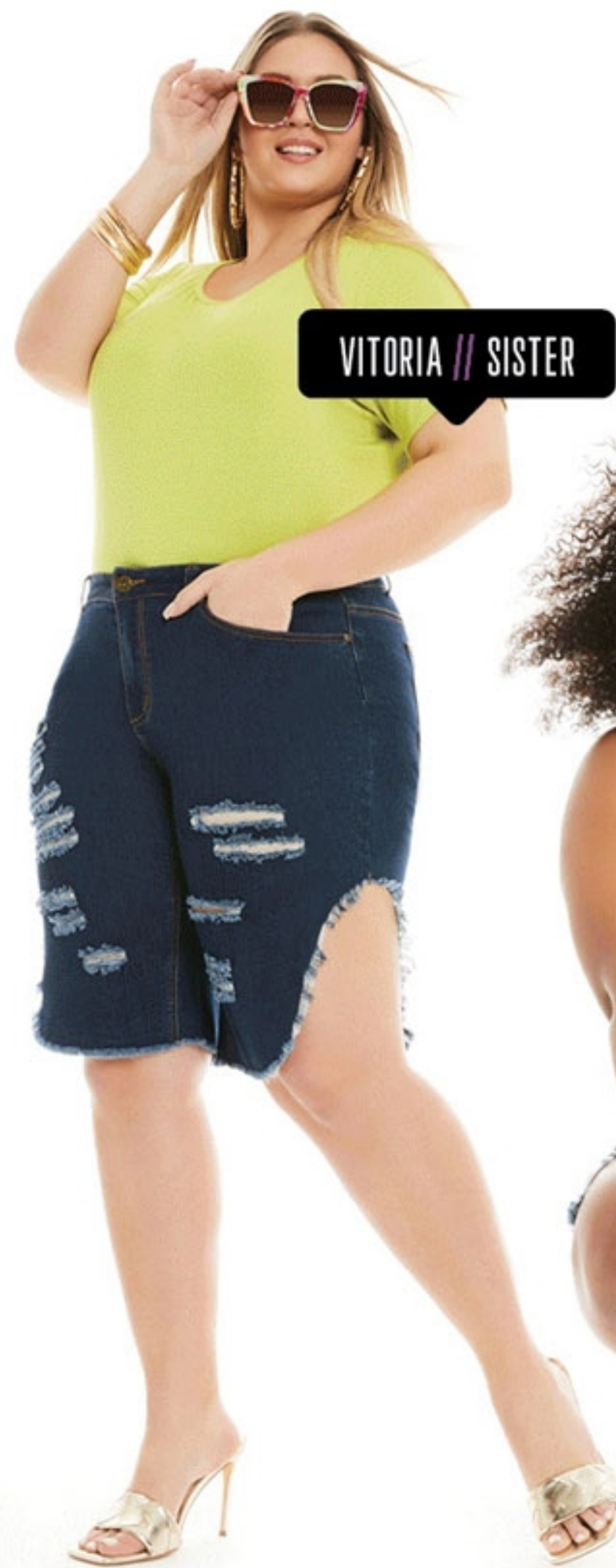
VITORIA // SISTER