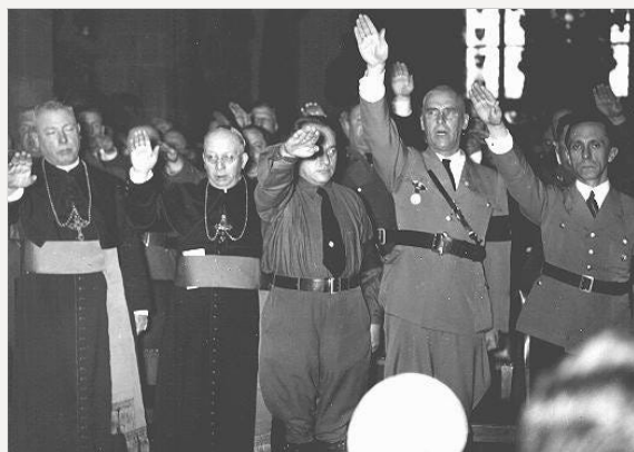
High Roman Catholic Clergy and Nazi officials: Hailmen

We all know that, as papal nuncio to Germany, the soon-to-be Pius XII concluded the famous Concordat with Nazi Germany. Pius XII, in his original letters to German bishops, frequently referred to Jews as “the people who put Him on the Cross.”