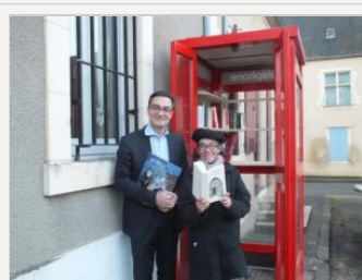
In the 'Journal du Centre', one proudly displays Auvity's pseudo-historical bullshit.