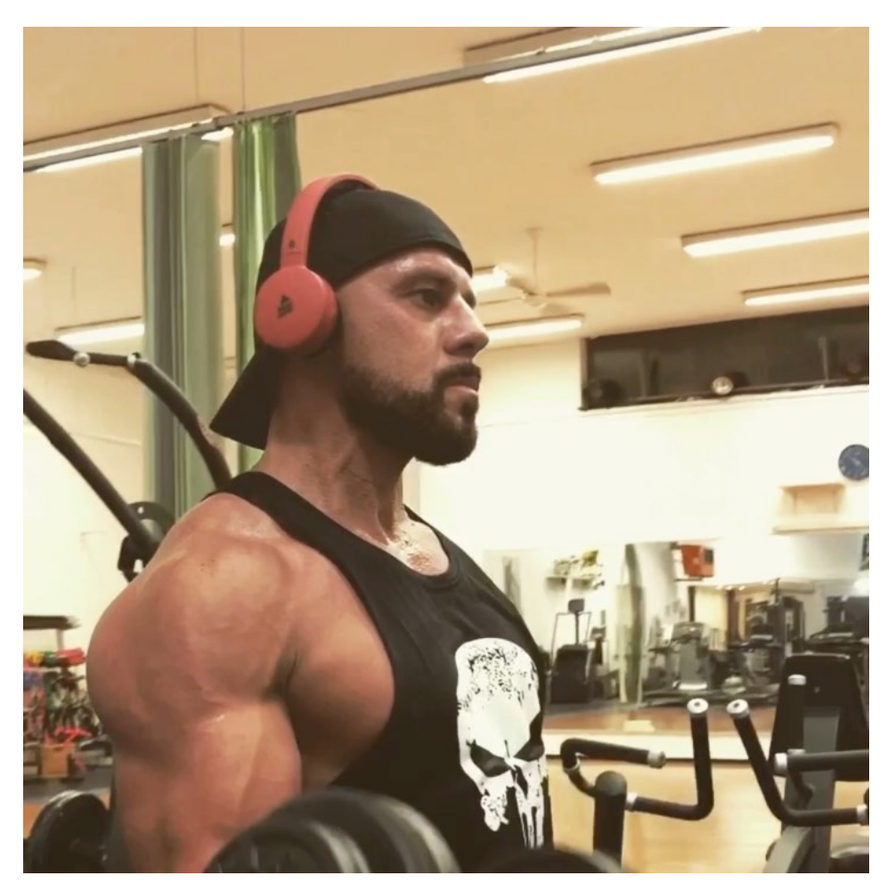
Stanozolol 10mg Magnus Pharmaceuticals. Stanozolol 10mg Magnus Pharmaceuticals is a derivative of dihydrotestosterone, chemically altered so that the hormone's anabolic (tissue-building) properties are greatly amplified and its androgenic activity minimized. Stanozolol 10mg Magnus Pharmaceuticals is classified as an "anabolic" steroid, and exhibits one of the strongest dissociations of ...