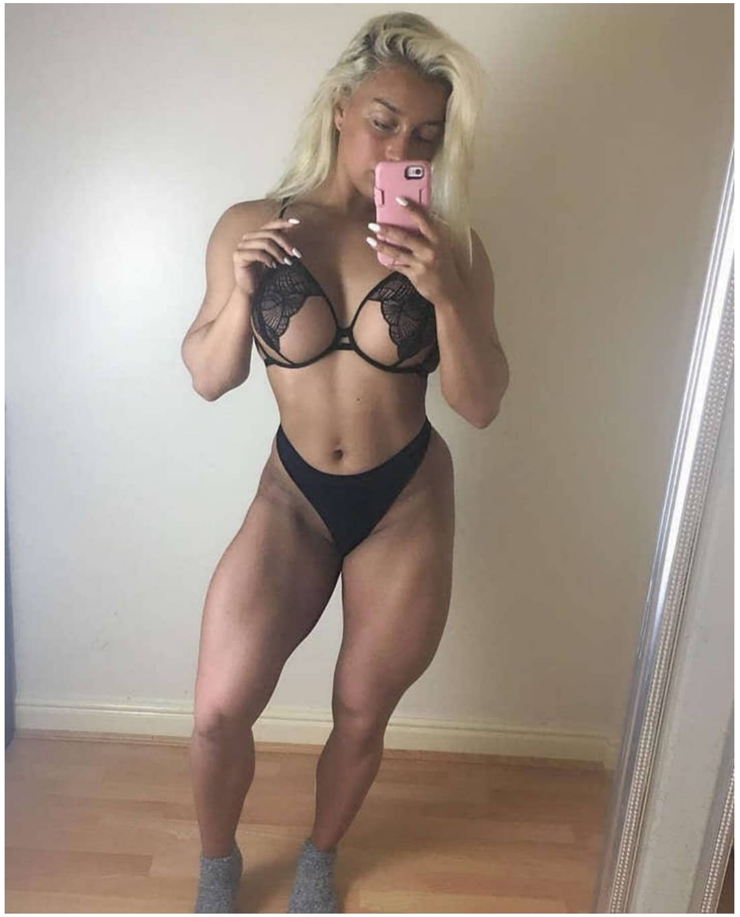
Whether you made a bad choice in life, whether you used to work out so bad, whether you always gave up in the past, that's okay. Because that doesn't matter anymore.