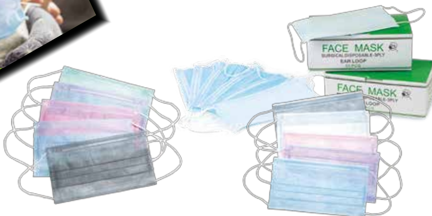
S002-NW (2 Ply Earloop)