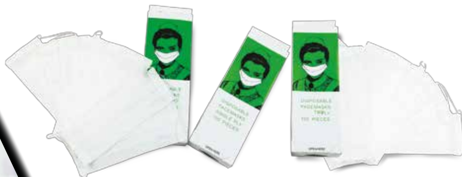
S001-PAPER (1 Ply)