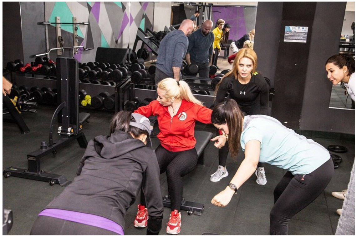
#alphalete #alphaleteathletics #ehplabs _ausnz #teamehp #aesthetics #aestheticshoot #aestheticphoto #fitness #fitnessmodel #fitnessmotivation #gymlife #fitnessdedication #fitnesslife #instafit #musclemodel #modelshoot #instafitness #modelphotography #gymlifestyle #fitgoal #streetwearstyle #streetwearclothing #fitphysique #menphysique #fitgoals #mensphysique #physiquemodel #mensfashionwear #gymmotivation