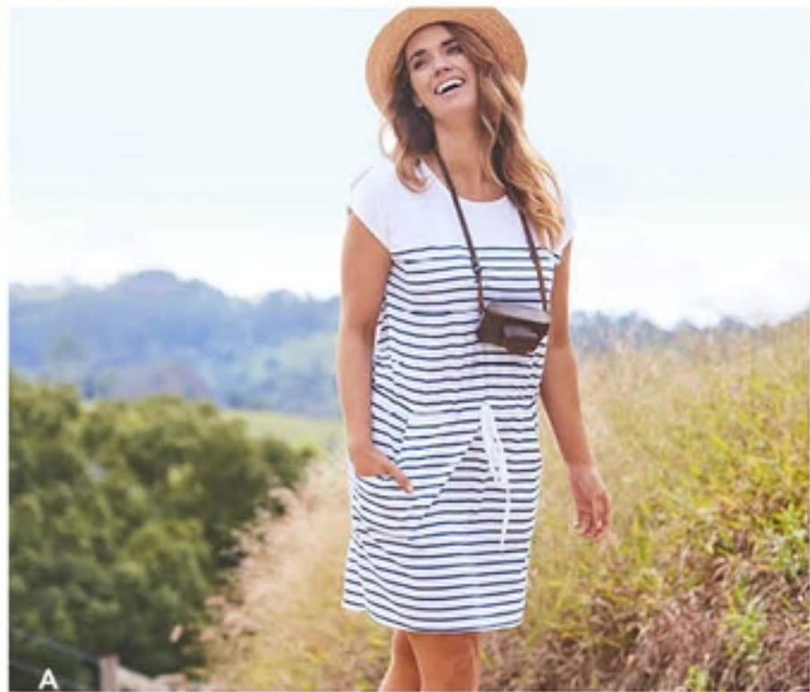
A. BIRD KEEPERS The Opened Shoulder Stripe Dress BIRDK-916 $69.95 (8-22)

Summer is here, and what better time to freshen up your wardrobe than now with this exciting selection of easy-wear staples from one of our best-selling labels, bird keepers. There's over 400 styles to choose from, each designed exclusively by birdsnest to bring versatility and freedom into your everyday outfits.