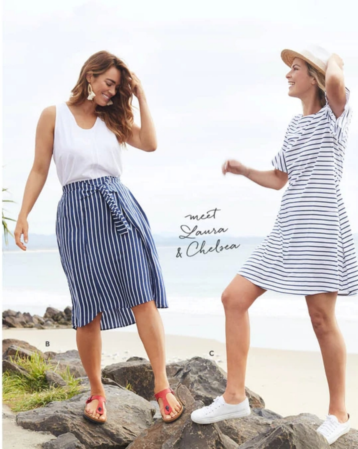
C. BIRD KEEPERS The Cotton Bamboo Frill Dress BIRDK-860 $79.95 (8-22) also in bluegold