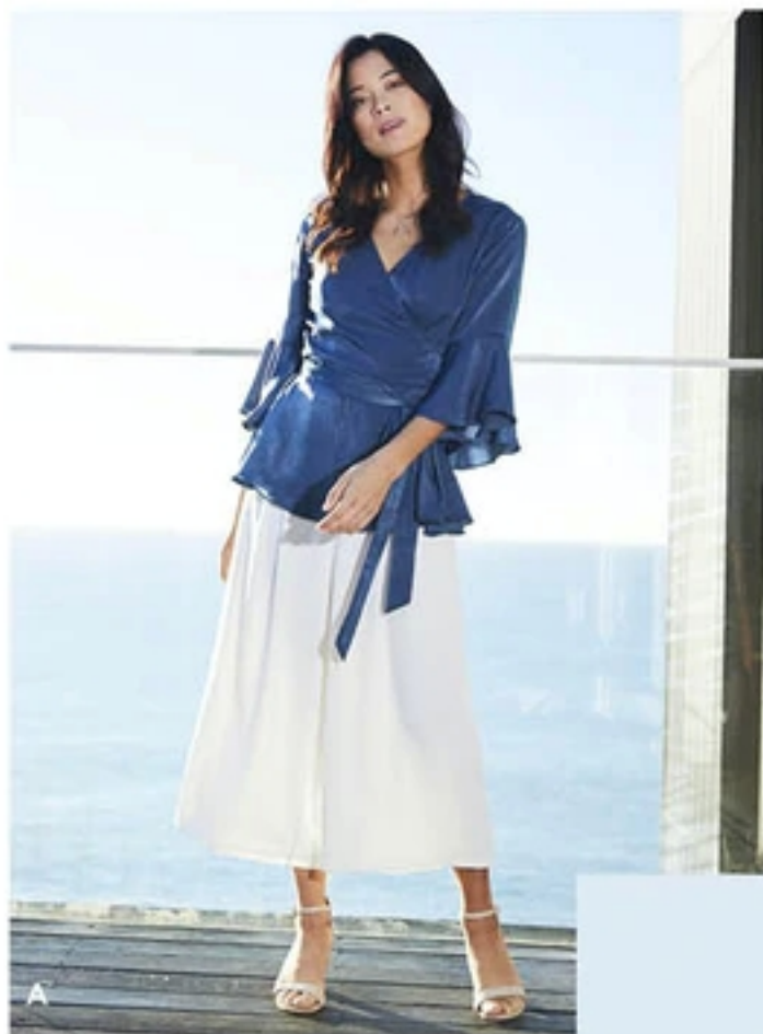
A. BIRD BY DESIGN The Luxe Wrap Top BKBD-201 $119.95 (8-22) Made in Australia BIRD BY DESIGN The Flowy Culottes BKBD-192 $109.95 (8-22) Made in Australia