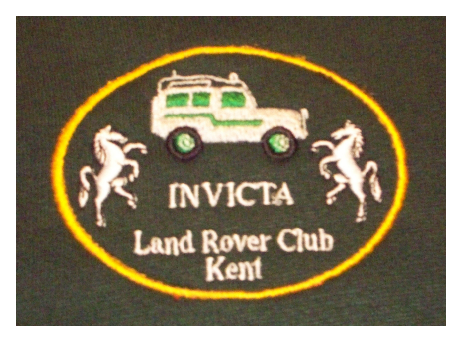
Invicta Landrover Club Kent Monthly Meeting News. Tuesday 05<sup>th</sup> May 2015.

Good evening and a warm welcome to you all.