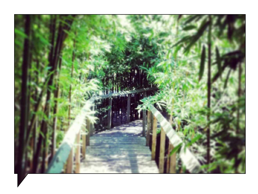
The First Week...