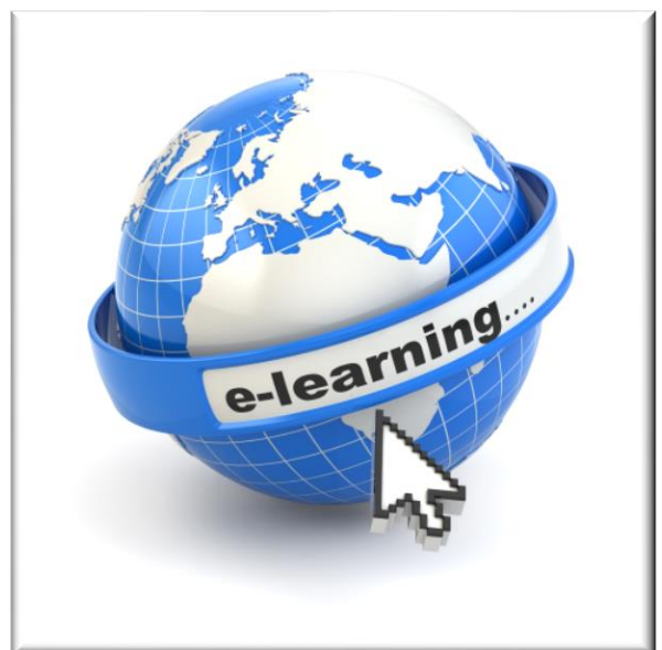
Creating learning to reach the world

Each scheduled program is kept to a maximum of 12 attendees to ensure individuals gain maximum benefit from the program. By limiting the numbers we have found that attendees achieve more over the three days and our facilitator has time to give attention to each attendee and assist one-on-one as required during the program. We encourage you not to leave it to the last minute to register for the program as the limited numbers mean they fill quickly.