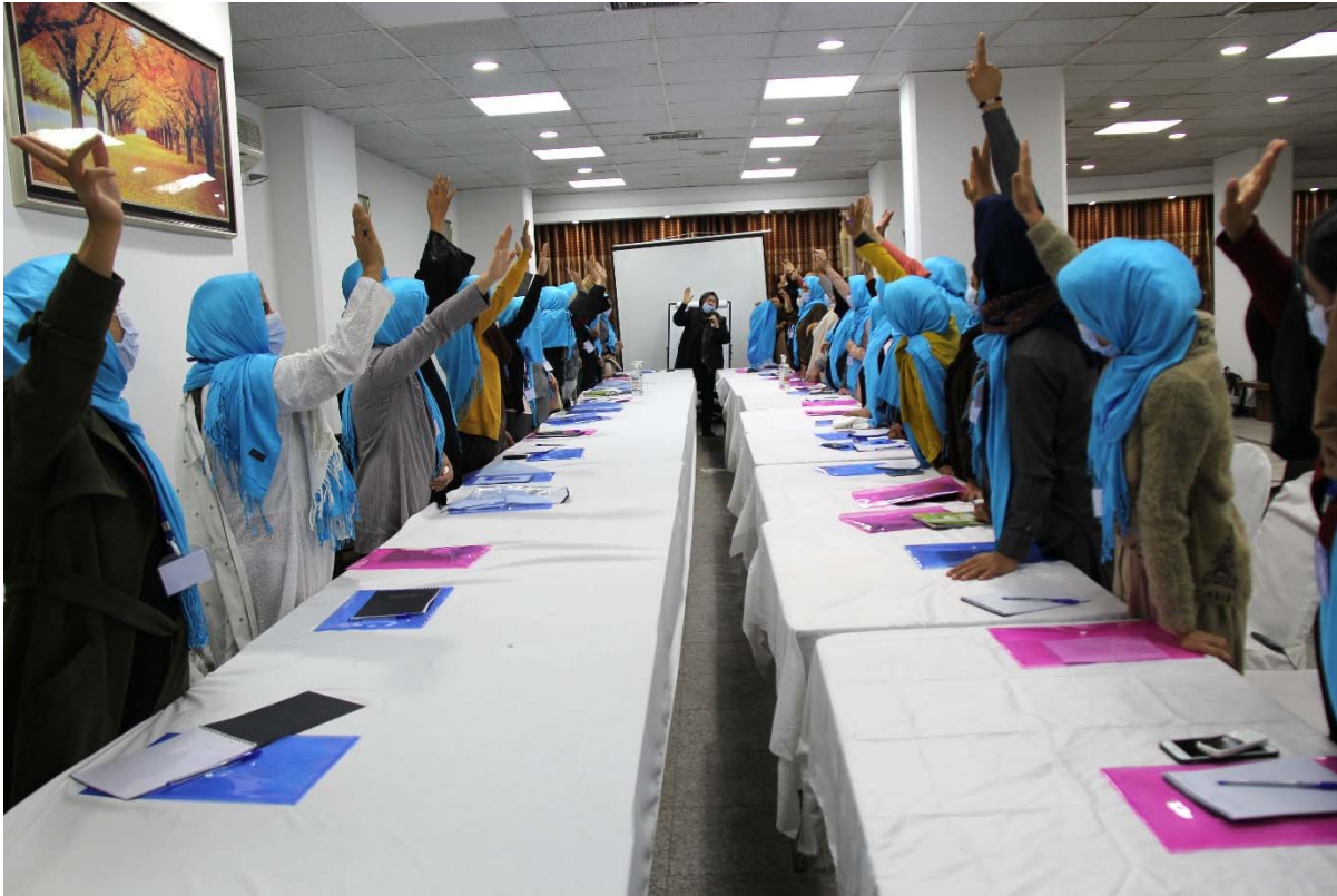
Participants taking part in the inclusive decision-making process

Zardozi has completed a successful strategy workshop in early November 2020 in which representative of Zardozi's beneficiaries presented their issues and opinions regarding the strategic direction of Nisfe Jahan (a grassroots women's support organization that partners with Zardozi).