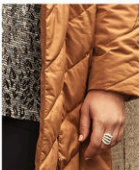
Textural patchwork in a super stylish winter-ready puffer coat.