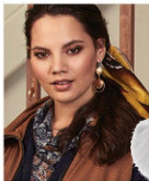
HAIR: Tie it back to elongate your neck when wearing bulky fabrics and scarves