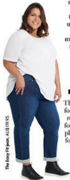
The Easy Fit jean, AU$119.95.