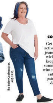
The Bailey Coolmax jean, AU$119.95.