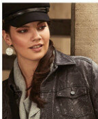
A twist on our fav blue jean jacket. It's a new season, so here's a new print.

COLOUR CODE: Deep plums and ametrine work back well with a classic black, and with the right combo a tan can make the colour a little more casual.