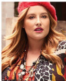
LIPPY: A splash of colour to lift a dark outfit