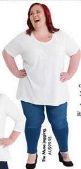
The Muse legging, AU$99.95.

The Easy Fit jean is for every body! The relaxed fit is ideal for casual dressing, plus they're perfect for cuffing to show off your kicks.