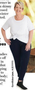
Curvilinear jean, AU$119.95.

Get the fabric tech of activewear in every day jeans. Coolmax denim wicks away moisture, keeping you cooler in summer and warmer in winter. Made in a skinny cut with distressed patches, your winter denim is sorted.