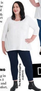
The Best Friend legging, AU$99.95.