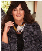
Add a scarf to a jacket and tuck it under the collar for warmth, doubling as an accessory.