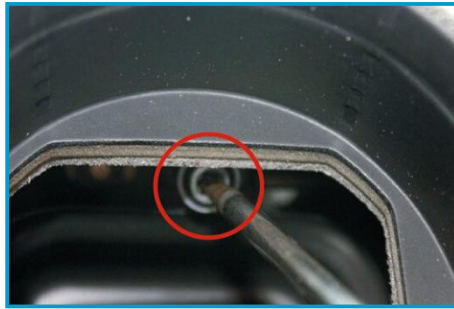
2 Remove two air conditioner outlet screws