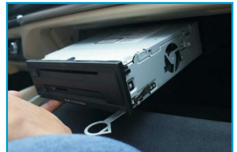
9 Remove the MMI head unit from the glove compartment