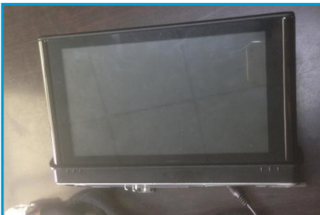
7 Replace with new display screen