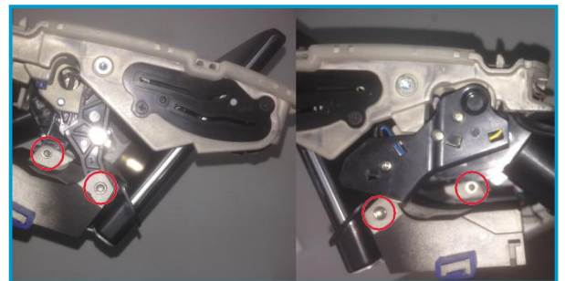
6 Remove four screws holding the screen