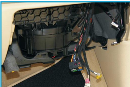
10 Remove the glove compartment to run the wires.