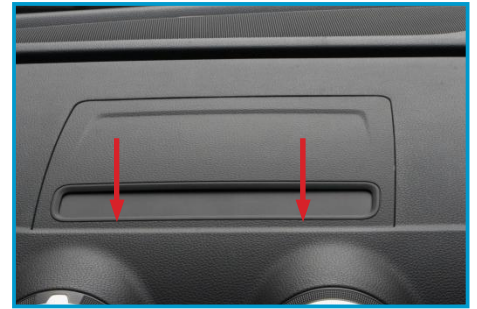
3 Disassemble the screen cover