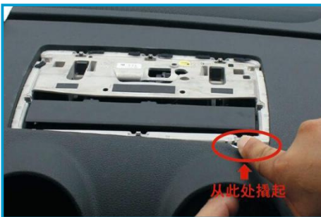
4 Disassemble the Display assembly