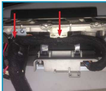
8 Run the wire as shown from new display, tie two points marked with red arrows. If the cable is not properly fastened it will interfere with the screen rising mechanism.