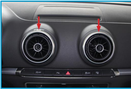
1 Remove two air conditioner out vents