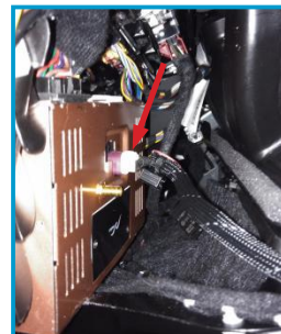
11 Place the new navigation main unit box properly, install the new display back, run wires to the glove compartment, and connect wires to the corresponding plugs.