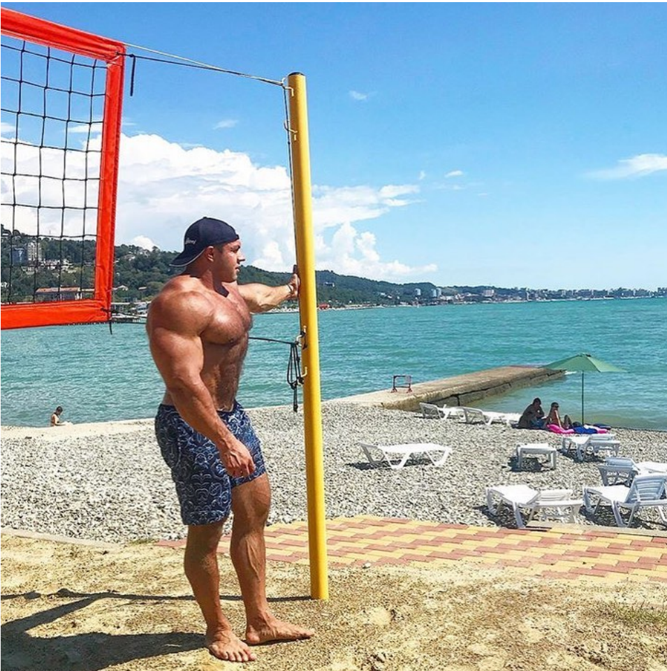
#SHAPEU #ptbrenm #personaltraining #onlinepersonaltrainer #plantbased #bandworkout #shoulders #strength #fatloss #muscle #motivation #thursday #leicester #nuneaton #onlinecoach #nutrition