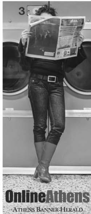
OnlineAthens ATHENS BANNER-HERALD