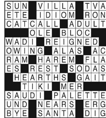
5-18-20 © 2020 UFS, Dist. by Andrews McMeel for UFS