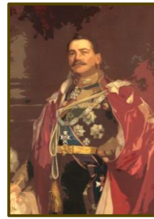
King-Commander Colmund II

The United Commonwealth is an authoritarian constitutional monarchy. The monarch is the head of state and the head of government. The constitution is defined by the Instrument of Government, which vests the monarch with executive, legislative, and judicial prerogative over the realm; all officials of the government then are acting in the name of the monarch. However, the monarch is compelled to govern “by and with the advice of” the Commonwealth Executive Counsel which is the largest and most prominent advisory council to the monarch.