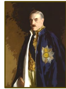
Premier Jacyen Harcourt

There are no mechanisms for elections of political parties. In the absence of a traditional legislature, politics in the United Commonwealth takes place via consultations between the Royal Household and a minority of the population who comprise various bodies such-as the Commonwealth Executive Counsel, the New Star Chamber, the Orders of the Garter, the Order of the Thistle, and various technical Syndicates.