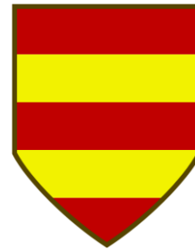
ARMS OF HARCOURT