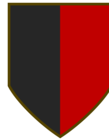
ARMS OF GREATOREX