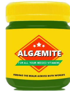
200g jar of Algæmite, the Commonwealth's more popular condiment.

The United Commonwealth is known for their simple, if hearty, culinary tastes, with emphasis on carbohydrates from bread and potatoes supplemented with protein stews. The majority of milk in the Commonwealth comes from macadamia nuts. Fruits and nuts from the Australian continent are particularly common additions to meals, since they are able to thrive better in Victoria's environment and can be grown in economically viable orchards on the surface outside of controlled zones; this has led to macadamia nuts, finger limes, Davidson's plums, and quandongs (English: Red Peaches ) becoming commonly available snacks and flavourings. Algæmite remains a staple or condiment for most meals is stored in great quantities as a resource food by the Crown. It served as the primary diet during the Endeavour Voyage as an effectively contained system, produced from waste nitrogen. Varieties of flavours of the substance are available for using as pseudo-jams, spreads, and dips and much of the plumbing infrastructure in the older colonies still routes back to plants where algæmite can be produced in bulk. Like all the Colonial Powers, the Commonwealth is a vegetarian state – since there are no animals.