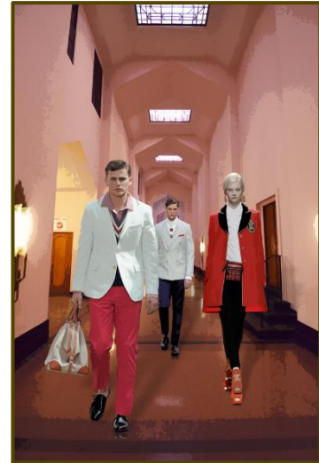
Anglic people tend to have brown hair though blonde is more common than it was on the Old World.

The subjects of the United Commonwealth are uniformly Caucasian and identify as “Anglic”, a portmanteau of Anglo-Celtic. The only means of attaining subject status is to be born as the child of two subjects. There is no policy to allow for permanent residency in the Commonwealth. Marriages between a subject and a non-subject are not recognised and not attainable within the Commonwealth itself. Free-travel by foreigners is highly restricted in the majority of the Commonwealth and is typically done under required escort unless the foreigner has a diplomatic visa. Freedoms such as that of movement or the right to own property is limited to segregated districts called “Foreign and Diplomatic Concessions” (FDCs). FDCs are established around specialised industrial ports which exclusively handle in intercolonial imports and exports with adjoining districts accommodation and entertainment of foreign visitors.