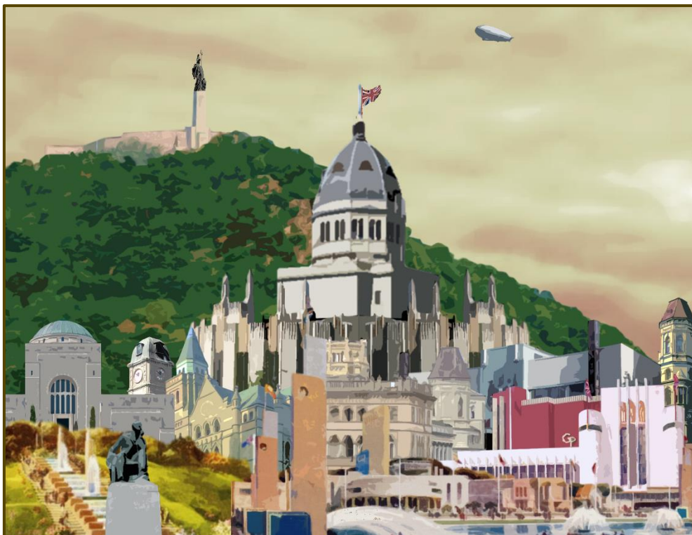
View of Melbourne Palace from Vainglory Ward, with the High Imperial Temple of Cecil Rhodes on the right and Dauntless Hill and Victoria Point in the background.

Venture Station was built as the first port and industrial area and remains the primary dockyard in Vouchsafe, location of the Vouchsafe Loch Algæ Mill, Century Station and other industrial enterprises. Vainglory Station was built as a water purification and oxygen plant on the coast of a large bay, these were eventually transferred to Venture Ward and Vainglory emerged as the colony's upper-class downtown, entertainment, residential, and business district. Valiant Station was built as a large solar farm and Valorous for large-scale manufacture outside of the underground colony and both eventually grew to become a mixture of low-to-mid class residential and industrial zones. The Harcourt Heavy Industries factory and shipyard is located close to the coast in Valorous Ward. Verdant Ward was built to produce food in large greenhouses using the natural light of Procyon A. These initial greenhouses and their plants were gradually located as the colony expanded. Today Verdant Ward is a middle-class residential and commercial district of square buildings built around green central courtyards.