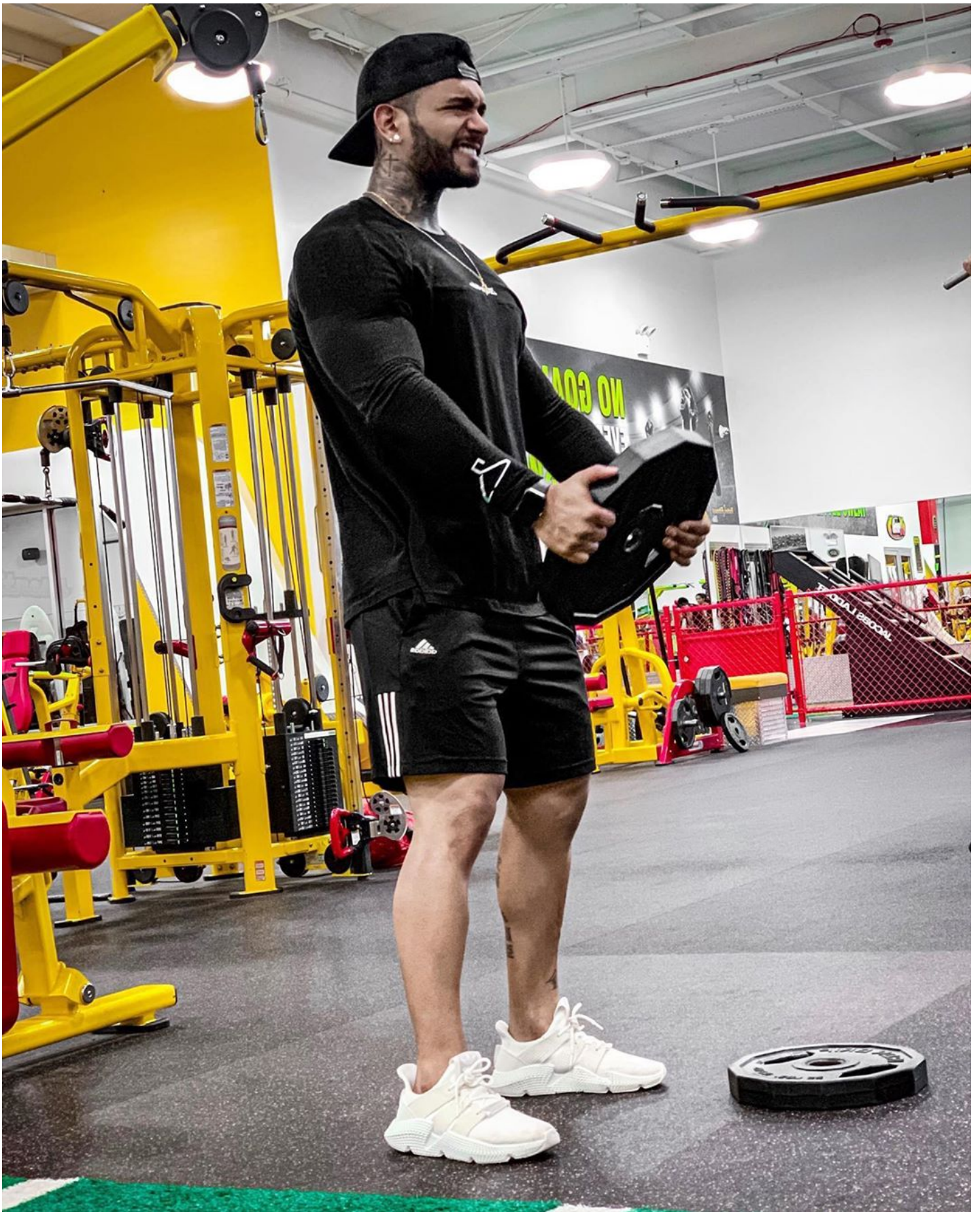
#fitness #recovery #workout #gym #fitnessmotivation #coach #coaching #onlinecoach #healthylifestyle #bodybuilding #fitnesscoach #fitnessinstructor #modellingagency #fitnessmodel #muscle #fitbit #malmo #model #mensfashion #viktresa #pt #personligträning #style #hälsa #sverige #halmstad #photooftheday #fitnessjourney #dado_fitness 1289