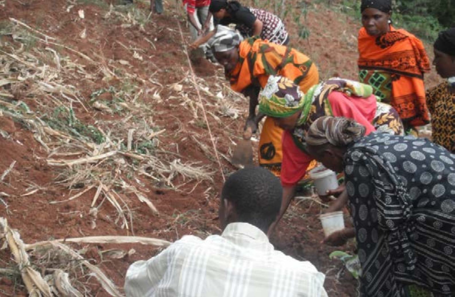
Demonstration of precise fertilizer application on small smallholder farm at planting