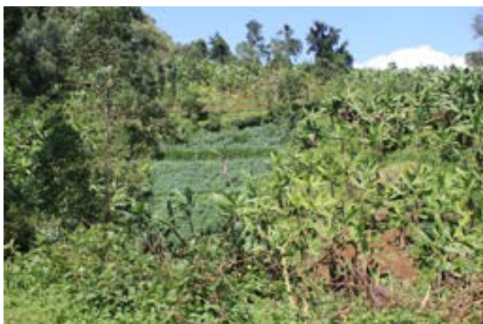
Trees planted on the slope of a hill to control erosion (S. Shames/EcoAgriculture Partners)

The effectiveness of the vegetation strips depends on the: