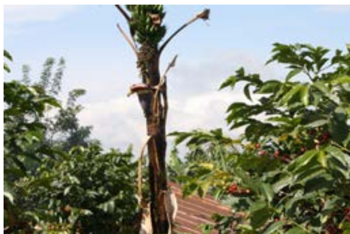
Banana trees and coffee plants grown together (S. Shames/EcoAgriculture Partners)