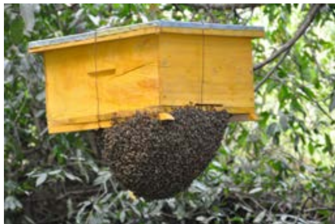
Bees colonizing a hive

Apiculture is the art and science of raising bees. It is an agroforestry technique with untapped potential and a quick investment pay back. Beekeeping has traditionally been practiced in Kenya. Over 80% of honey produced locally still comes from traditional hives. There is a need to embrace modern technology, such as the use of modern beehives like Langstroth and Kenya Top bar hives, in beekeeping.