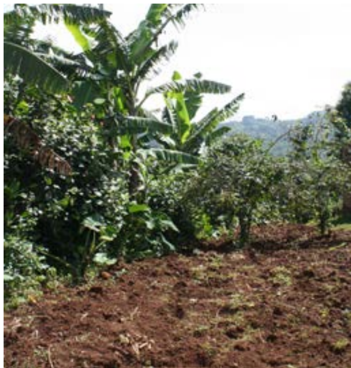
Incorporating leafy plants into soil

These are managed forest and shrub belts in areas bordering lakes, streams, rivers, and wetlands. Integrated riparian management systems are used to enhance and protect aquatic and riparian resources as well as generate income from timber and non-timber forest products (e.g. medicines and fruits).