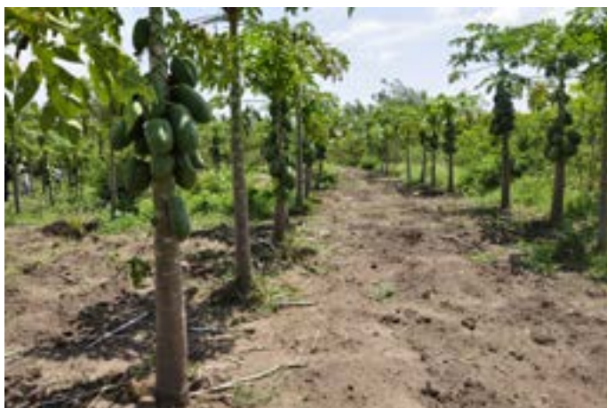
Trees on cropland

Trees may be grown in fields while crops are grown alongside or underneath. The practice of growing trees in this way can be done either by protecting and managing the trees that are already there or by planting new trees.