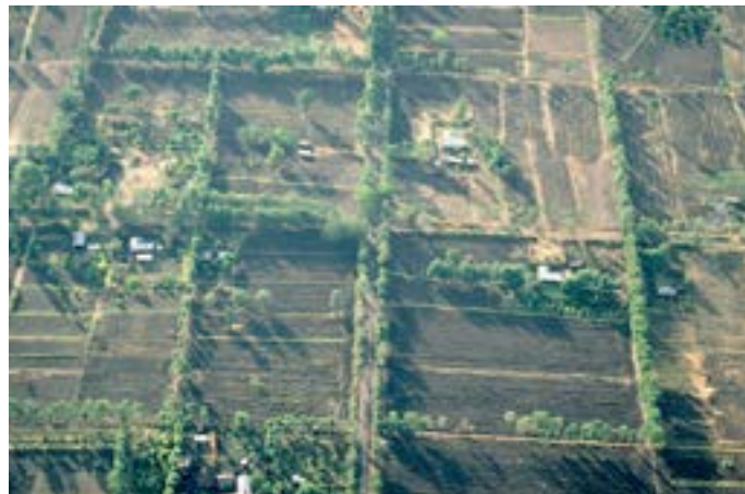
Boundary planting between small-holder plots

This involves planting trees on farm boundaries. It requires agreements between the neighbors involved to avoid conflicts due to the shading effects of the trees.