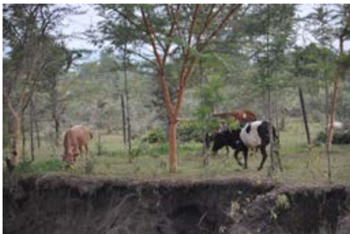
Woodlot in Kenya

Woodlots are an area on the farm set aside specifically for wood production. Woodlots may include a single species or a mixture of several species. Woodlots can also be useful for beekeeping by providing flowers for nectar. Examples of woodlots commonly planted by people in Kenya include: Casuarina , Sesbania , Gliricidia , Grevillea and Markhamia species.