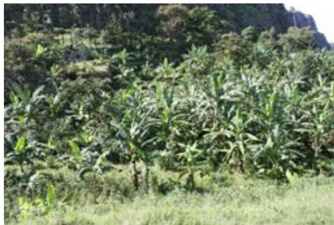
Banana trees above coffee crops in Mbale, Uganda

This practice involves growing shade tolerant crops such as coffee, tea and beans under trees such as Grevillea robusta , Cordia abyssinica , Faidhebia abyssinica , and Cordia Africana . The crops in most cases are plantation crops. The focus is on perennial components such as coffee tea which produce high value products. Trees provide microclimate conditions suitable for the growth of the tree species.