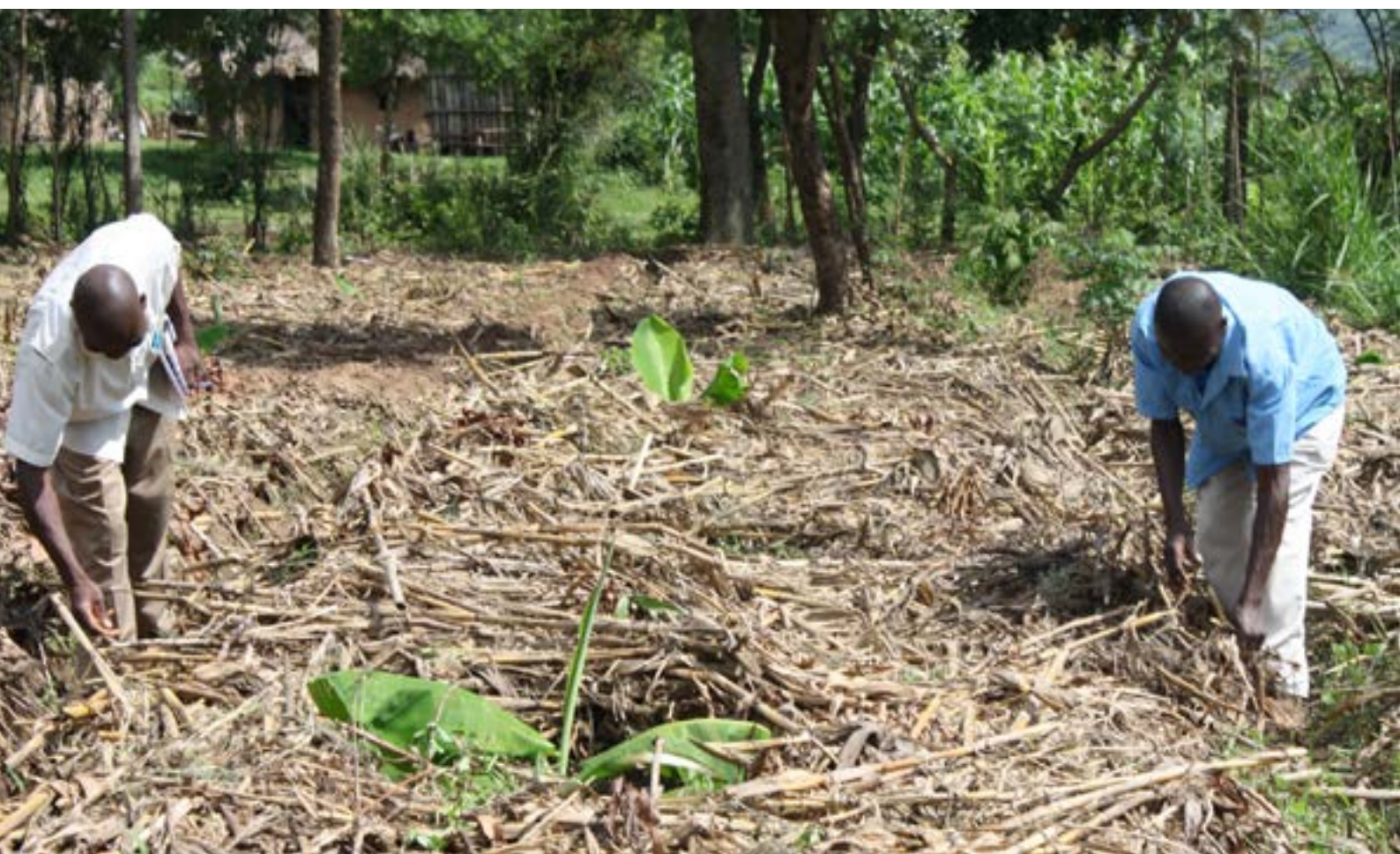
Mulching around banana crops

Mulching can improve the productivity of the land (i.e. crop yields) by making conditions more favorable for plant growth, i.e. conserving soil moisture, improving soil fertility and reducing soil erosion.