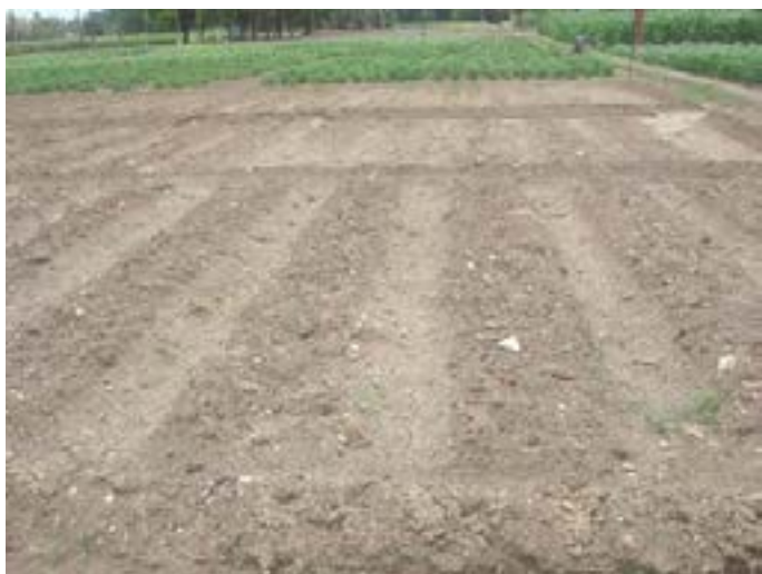
Broad beds and furrows ( http://www.agritech.tnau.ac.in/agriculture/agri_majorareas_watershed_watershedmgt.html )

The field furrows are blocked at the lower end. When one furrow is full, the water backs up into the head furrow and flows into the next field furrow. Broad beds, where the crops are grown and which are about 170 cm wide, are planted between the field furrows. They are similar to infiltration ditches.