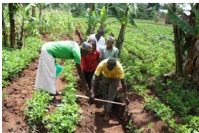
Digging a drainage channel

Diversion ditches and drainage channels remove excess water from the land. Diversion ditches and drainage channels can increase yields in flood-prone zones due to increased water drainage. By facilitating good aeration of the soil, they can also help avoid emission of N 2 O gas.