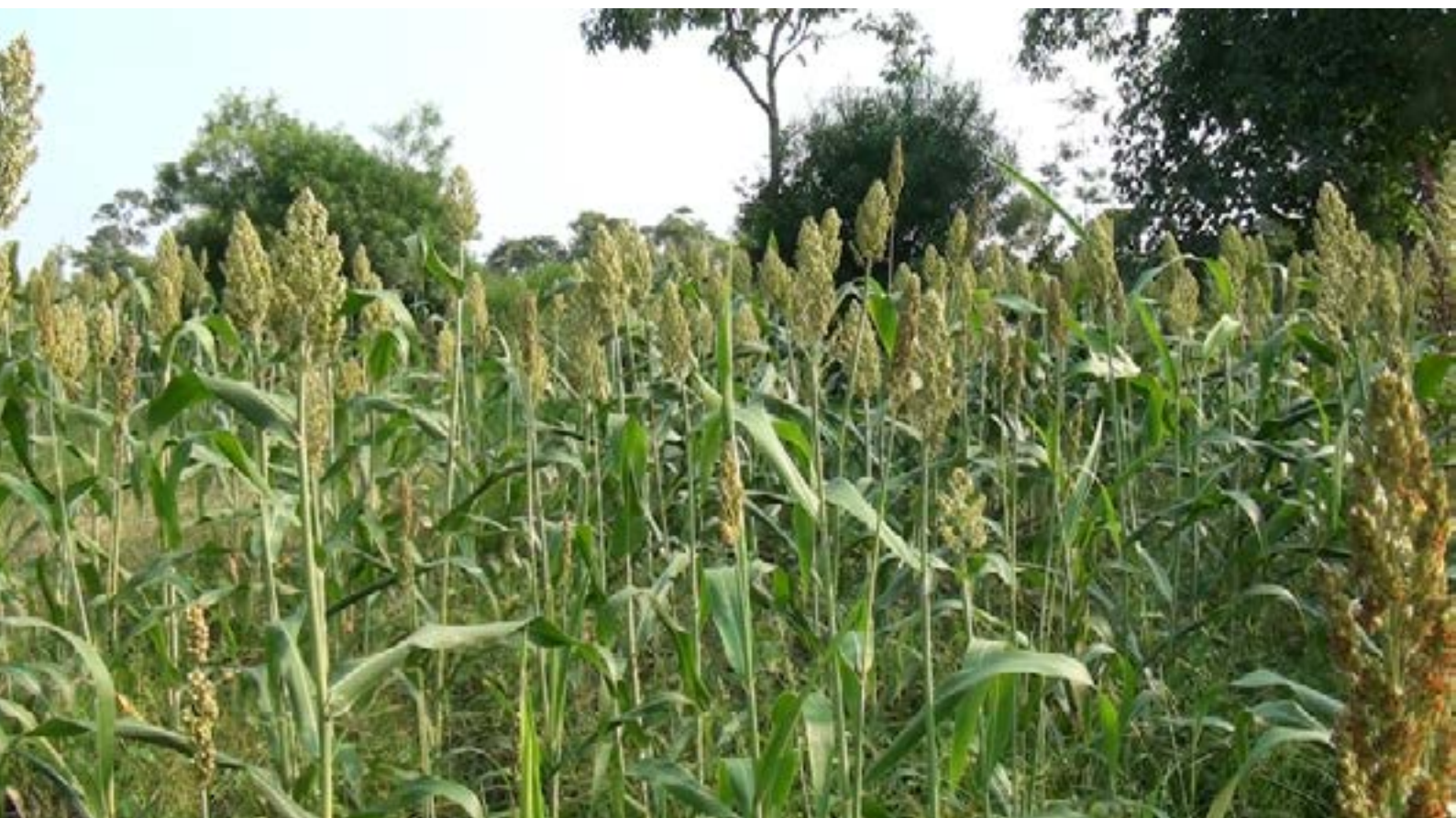
Improved sorghum

Plant improved crop varieties like hybrid maize, grafted mangoes, indigenous vegetables, mosaic resistant cassava, groundnuts and tissue culture bananas.