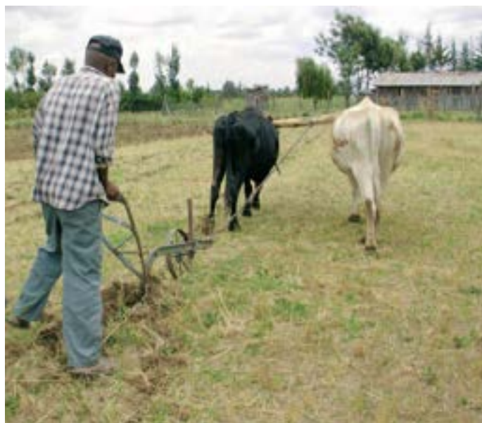
Conservation tillage (H. Liniger)

Recent studies on tillage show that conservation tillage increases soil carbon in the upper layers. This is of crucial importance for the productivity of most tropical soils.