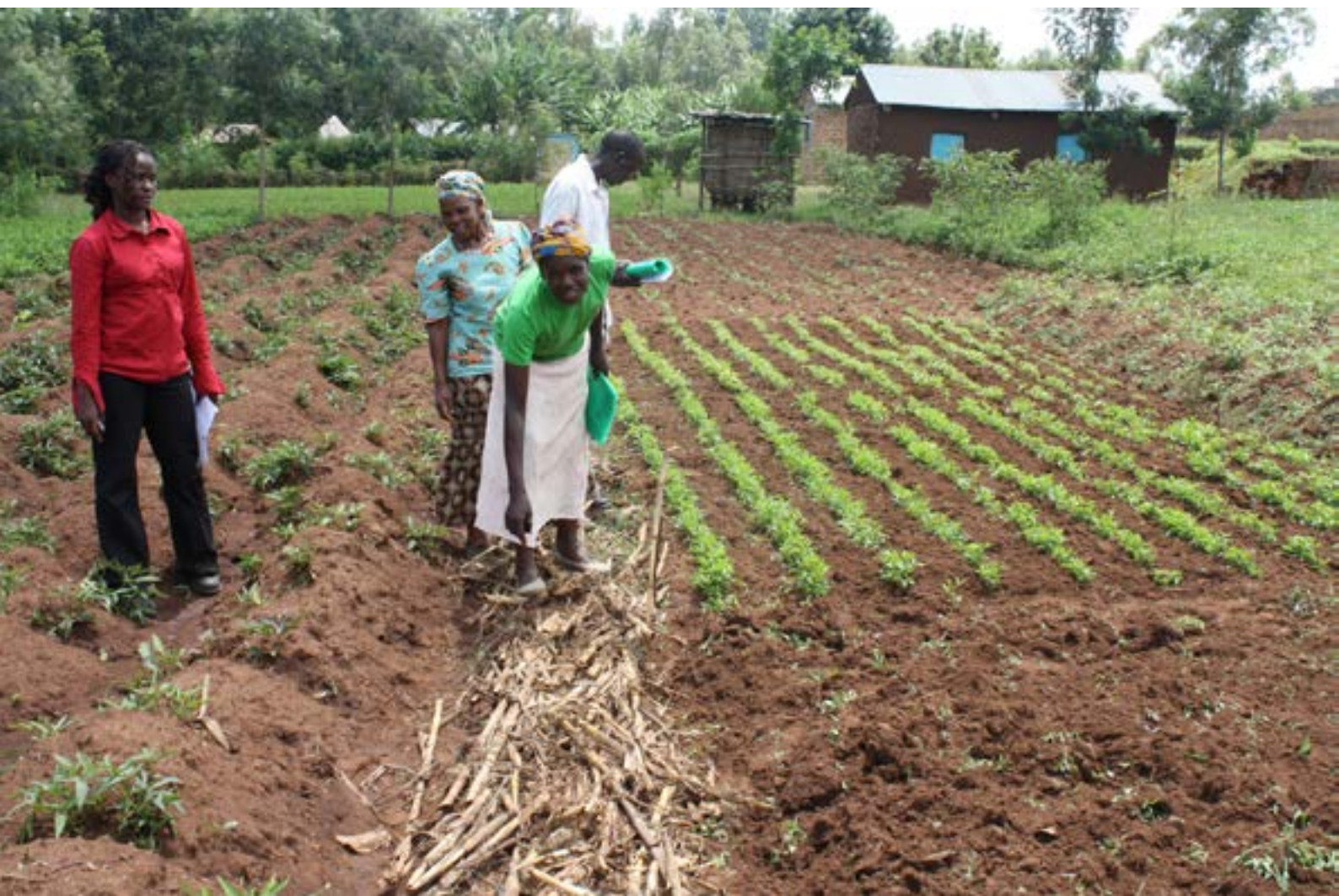
Trash lines in Kenya