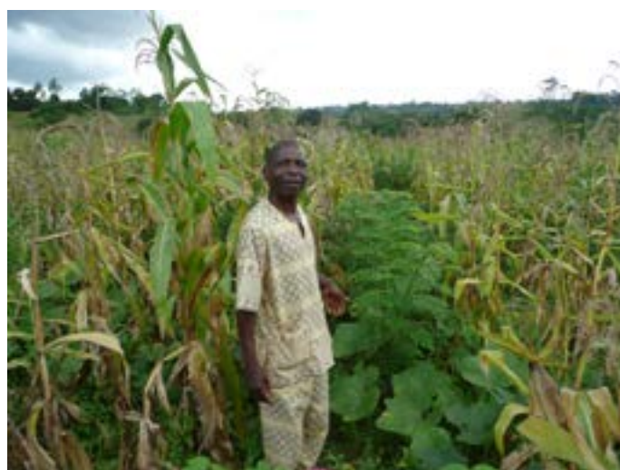
Nitrogen-fixing tree species planted within maize crops

This is the targeted use of a fast growing tree species to obtain the benefits of a natural fallow. Nitrogen fixing trees and shrubs are planted with the main aim of improving nutrient input into soil. They fix nitrogen and add organic matter to the soil. The practice is common where land is regularly fallowed especially in semi-arid areas. Nitrogen fixing trees and shrubs include Sesbania sesban , Markhamia lutea (siola), Calliandra calothyrsus , Casuarina equisetifolia (whispering pine), and Leucaena leucocephala (Lusina).