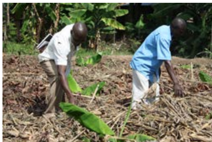
Planting banana trees in pits

Planting basins improve water use efficiency by the crops due to increased rates of water infiltration into the soil, which can improve crop yields and the increase the intensity of agricul-