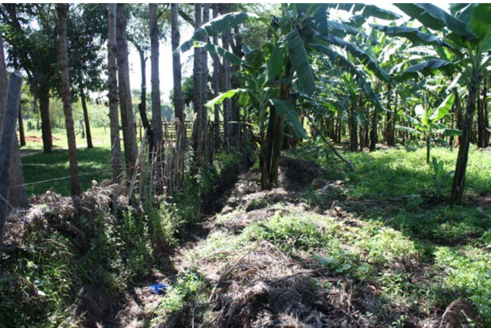
Infiltration ditch in Kenya