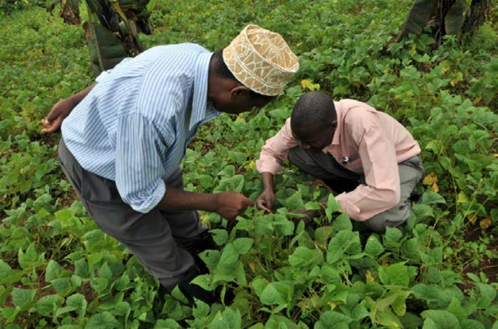
Assessing bean pests and disease in Uganda