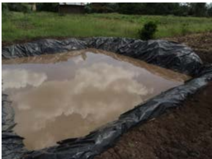
Water pan lined with plastic

A water pan is a shallow hole that collects and holds runoff water. Sometimes the pans are lined with plastic to prevent water loss.