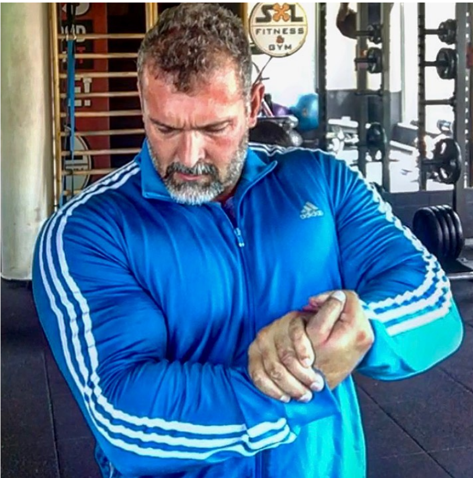
#workout #fitchick #blessed #myfitnessjourney #gains #dumbbells #sweat #soreisthenewsexy #sweatyhairdontcare #buns #augustbaby #leo #dontquit #keepmoving #chickenwings #davie #day2