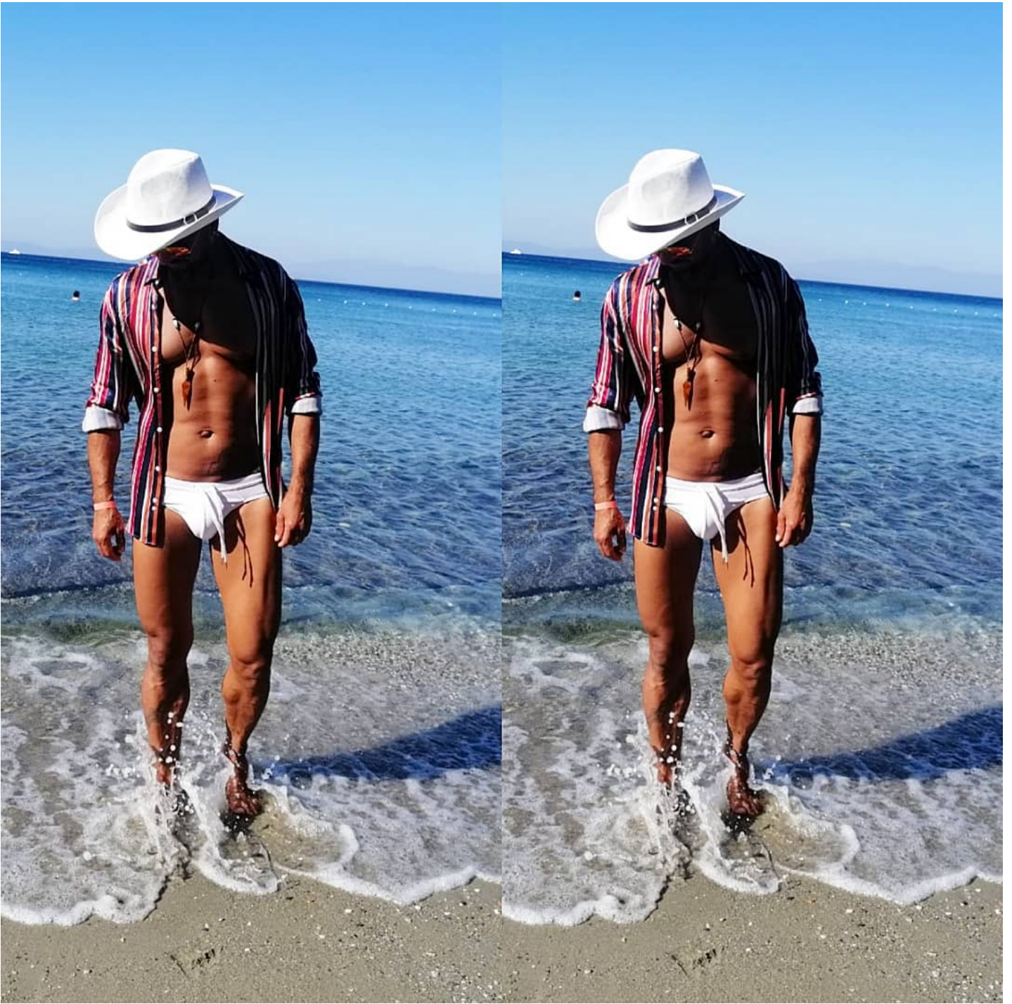
Is your coach as Swole as my Coach haha ☐ he is 5 weeks out Master Nationals in Florida. Let's go coach keep working hard and that Pro ☐ Card is yours ☐☐☐☐