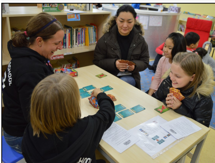
(Left) Students test their eye-hand coordination as they carefully remove Jenga blocks. (Top) Parents join students as they compete in the traditional strategy game of Battleship. (Above) Parents, students and teachers enjoy a game of Sleeping Queens.