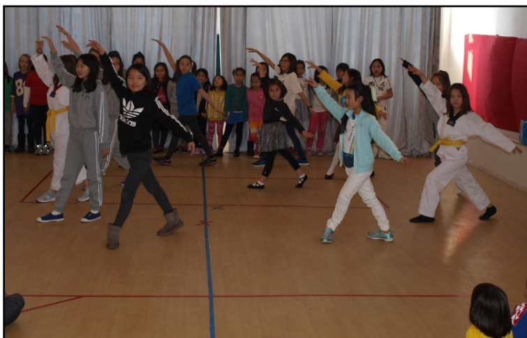
(Above) Students perform a dance number during the monthly Spirit Day Assembly. (Below) Gold House Captain and Co-Captain lead their Spirit House in a cheer after point totals for the month are announced.

Earlier in the day, classrooms were open during morning recess as teachers hosted a variety of physical activities in conjunction with the Spirit Day.