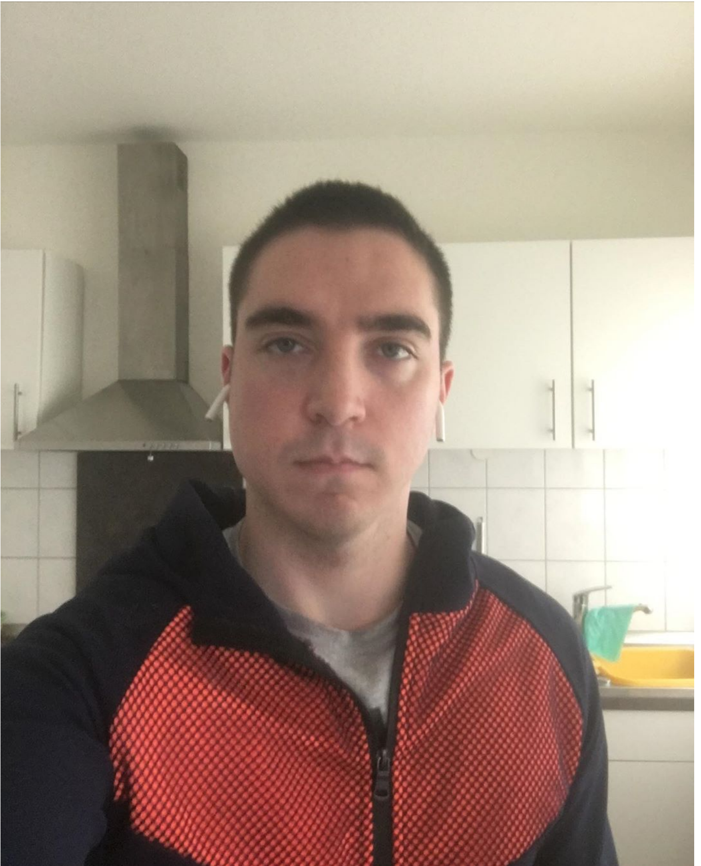
#cameraangle #upside-down #gameofhomes #crossfitcompetition #crossfit #fitnessmotivation #dedicated 480