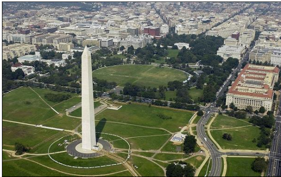
4. WASHINGTON, D.C.