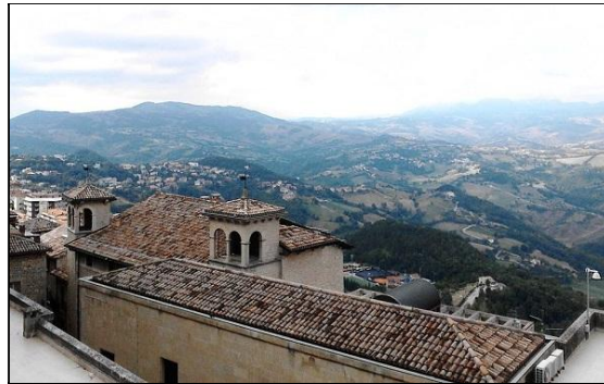
5. SAN LORENZO