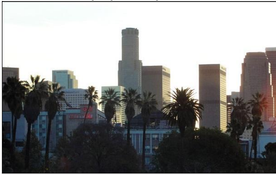
1. LOS ANGELES