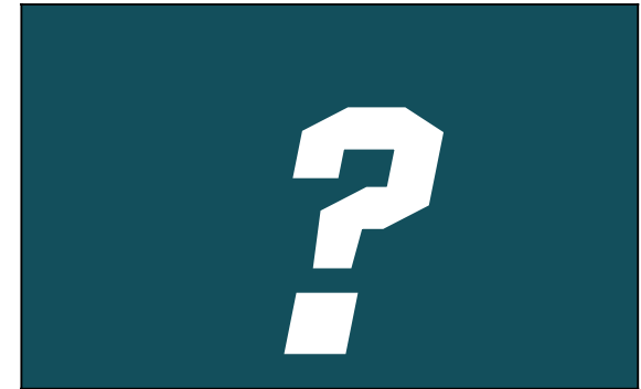
6. YOUR CHOICE