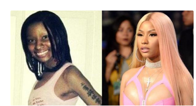
The Most Expensive Transformations In Hollywood Hooch Sponsored 5.