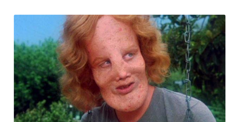
Remember Him? Try Not To Gasp When You See Him Now