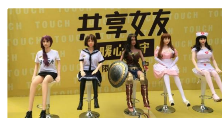
Fun's over: China's shared sex dolls snuffed out AFP News