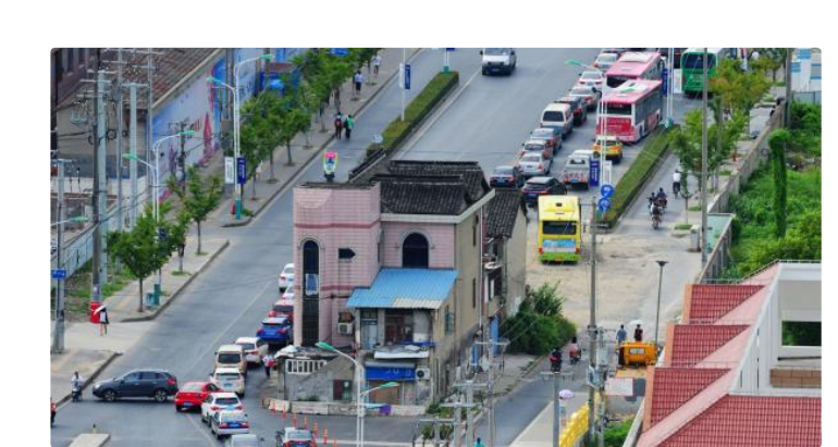
Notorious Shanghai "nail house" finally demolished after 14 years blocking traffic The Telegraph