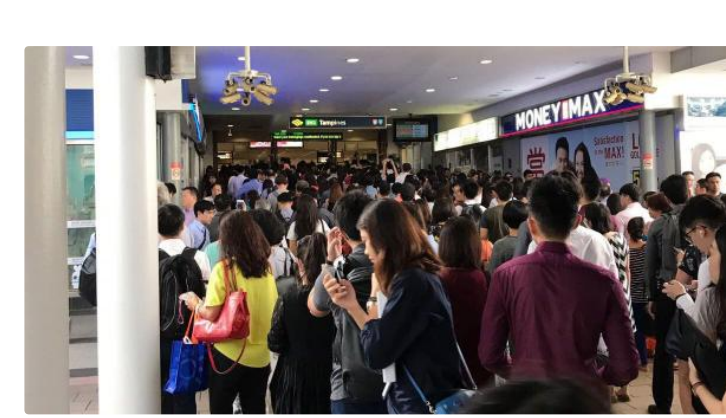
Train delay on East West Line causes crowds at stations