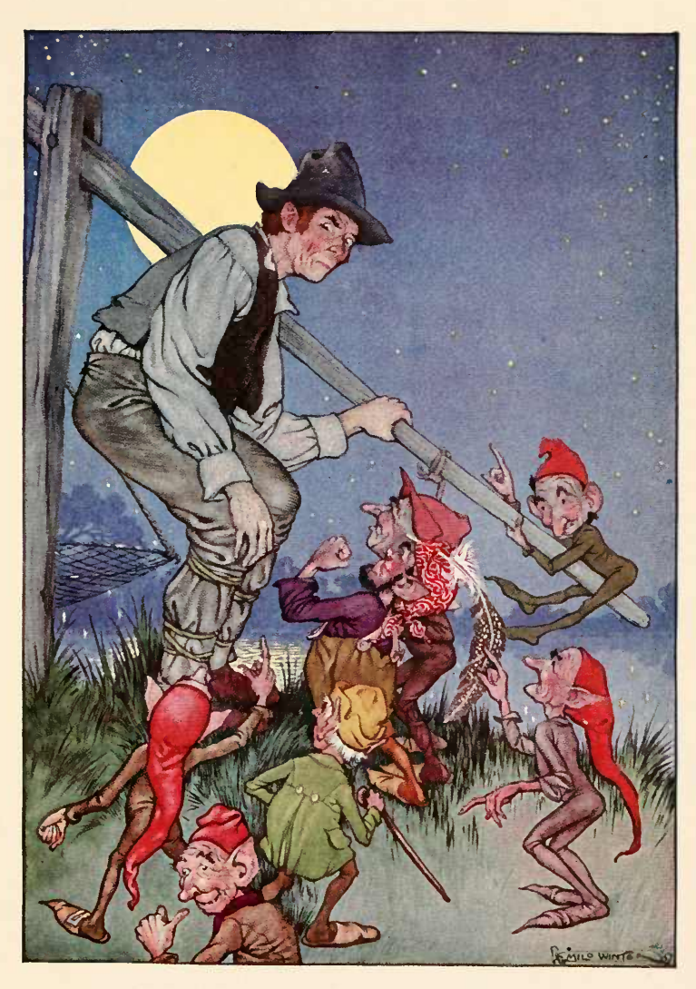
"DERMOD GAZED AT THEM IN WONDER"