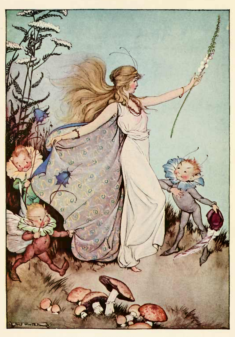
"THIS IS MAB, THE MISTRESS FAIRY" (page 209)