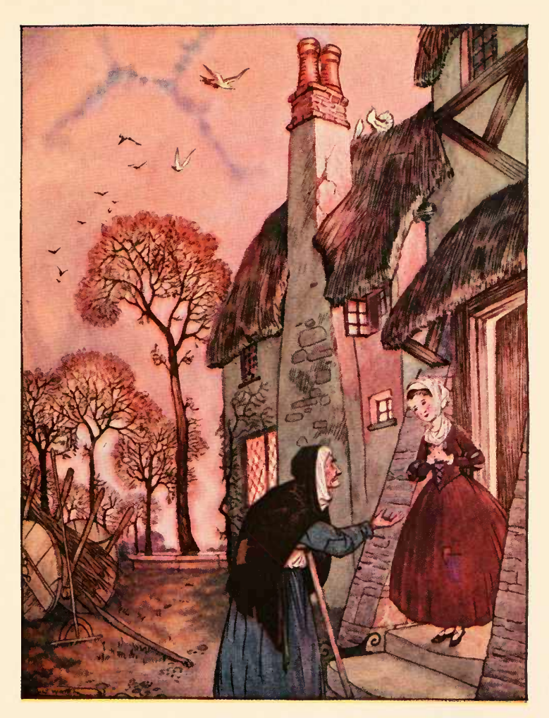
"CHILDE CHARITY CAME OUT AND ASKED THE OLD WOMAN TO TAKE HER SHARE OF THE SUPPER"